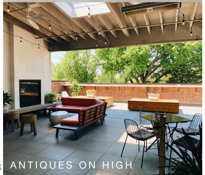
ANTIQUES ON HIGH