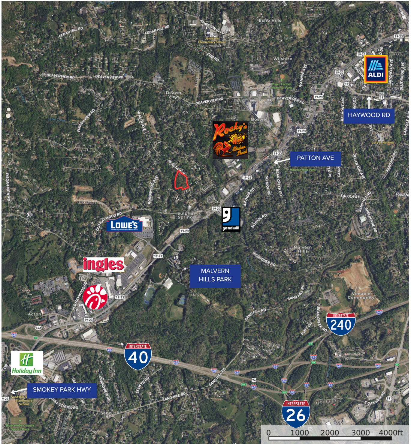
*BUSINESS LOCATIONS NOT EXACT