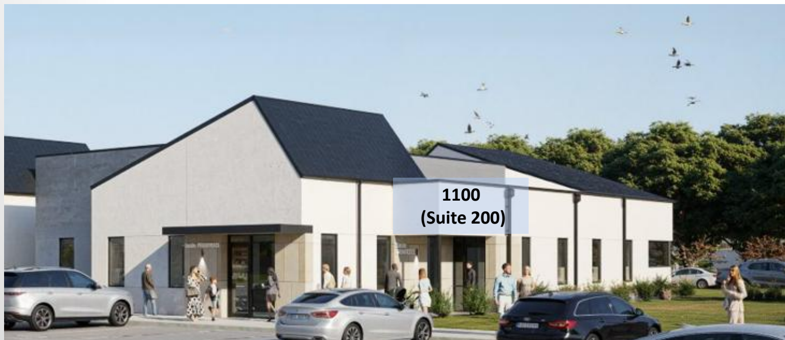
View from Timberbrook Pkwy 1100 Timberbrook Pkwy Suite 200