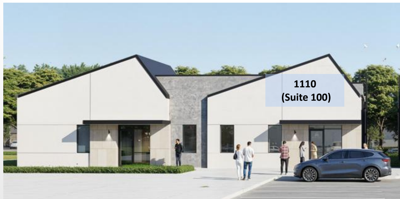
View from Timberbrook Pkwy 1110 Timberbrook Pkwy Suite 100