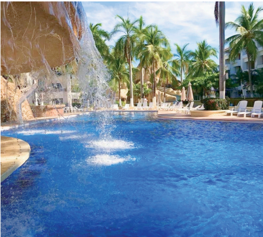
Above: The property basketball court at the Ixtapa Palace Resort offers guests a spacious and well-maintained area to enjoy friendly games and active recreation. Surrounded by lush greenery and scenic views, it provides the perfect setting for both leisurely play and competitive sports. Left: One of the three pools at the Ixtapa Palace Resort is a serene oasis, featuring sparkling waters set against a backdrop of lush tropical foliage.