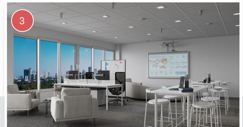
RENDERING - COLLABORATION AREA