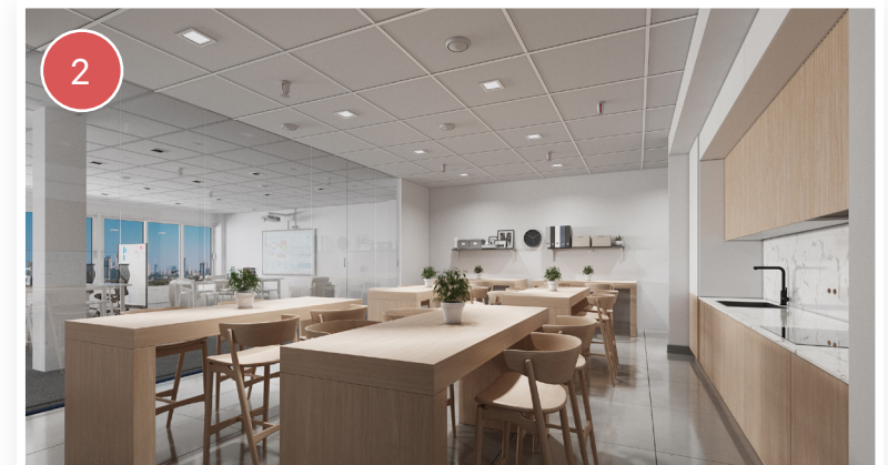
RENDERING - EAT-IN KITCHEN