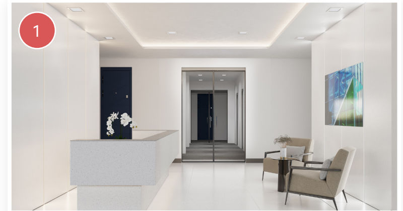
RENDERING - RECEPTION