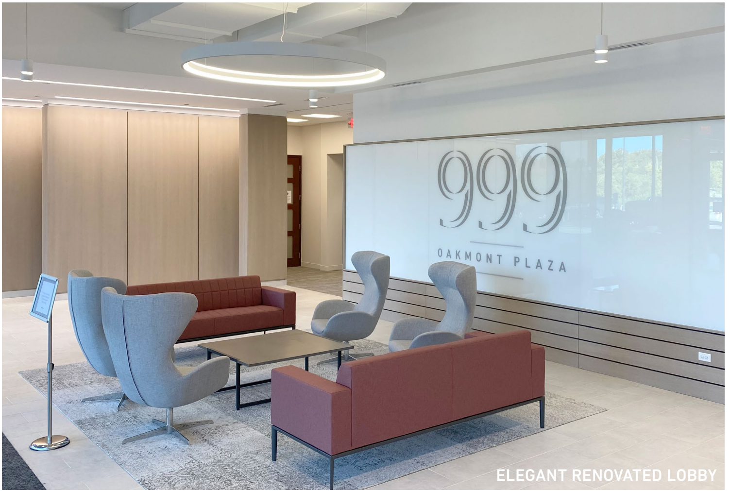
ELEGANT RENOVATED LOBBY