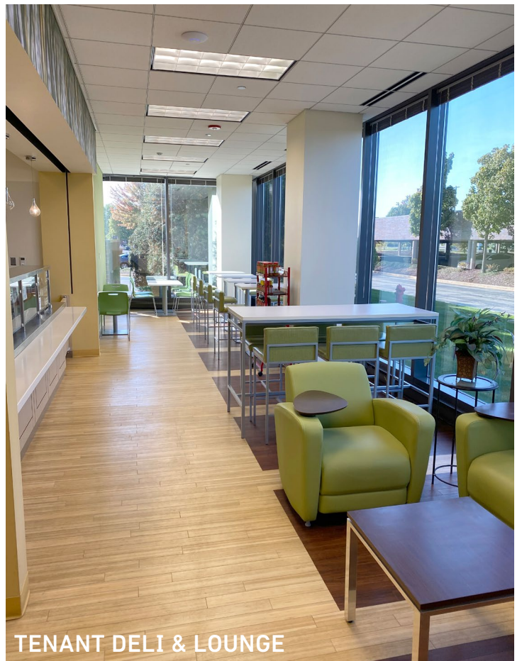
TENANT DELI & LOUNGE