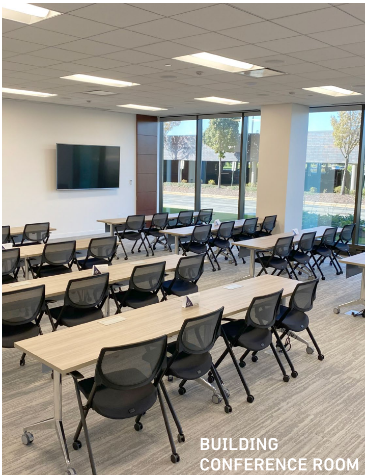
BUILDING CONFERENCE ROOM