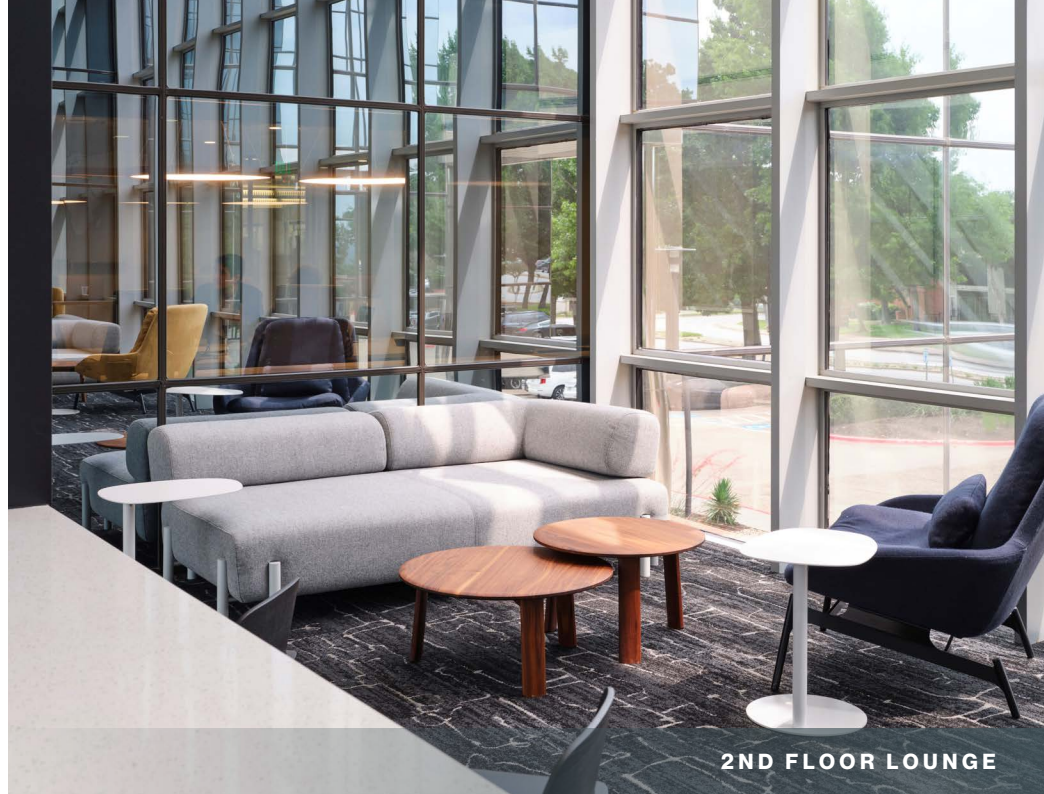
2ND FLOOR LOUNGE