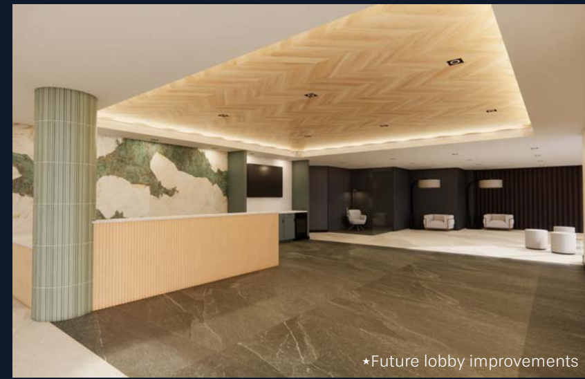
*Future lobby improvements

Building Size: 281,036 SF Stories: 14 Year Built/Renovated: 1986/2017 Sustainability: ENERGY STAR® rated, LEED Platinum® Parking: 3.73/1,000