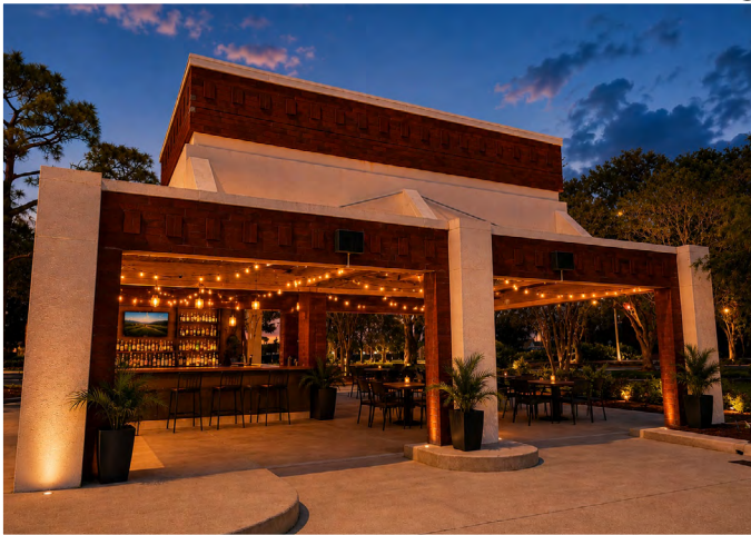
Potential Outdoor Seating Area - AI Model