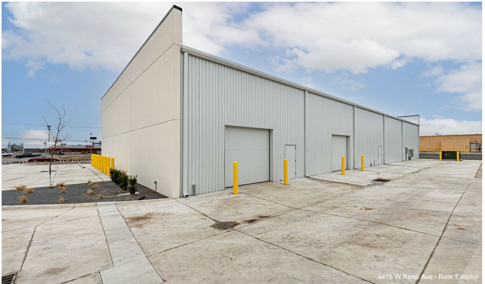
4415 W Reno Ave - Rear Exterior