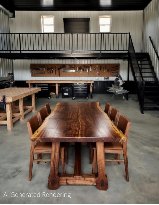
AI Generated Rendering