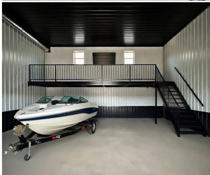
AI Generated Rendering