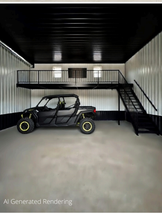
AI Generated Rendering