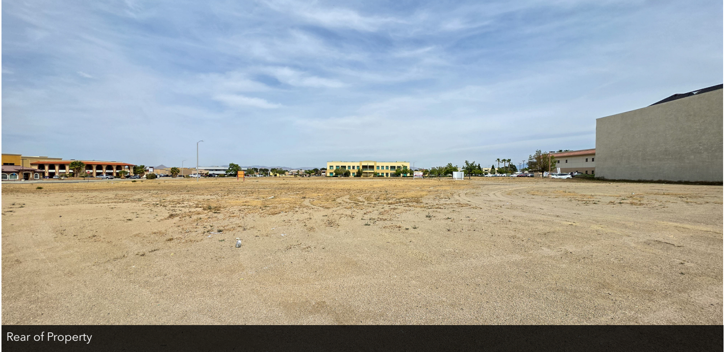
Rear of Property