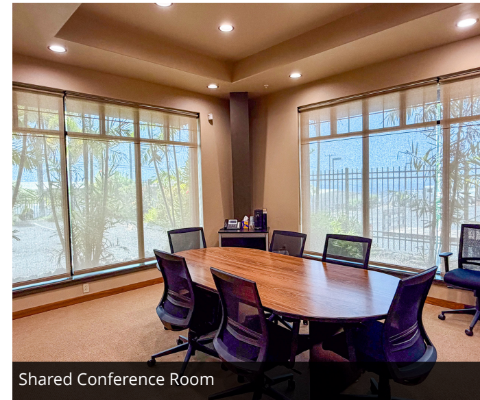
Shared Conference Room