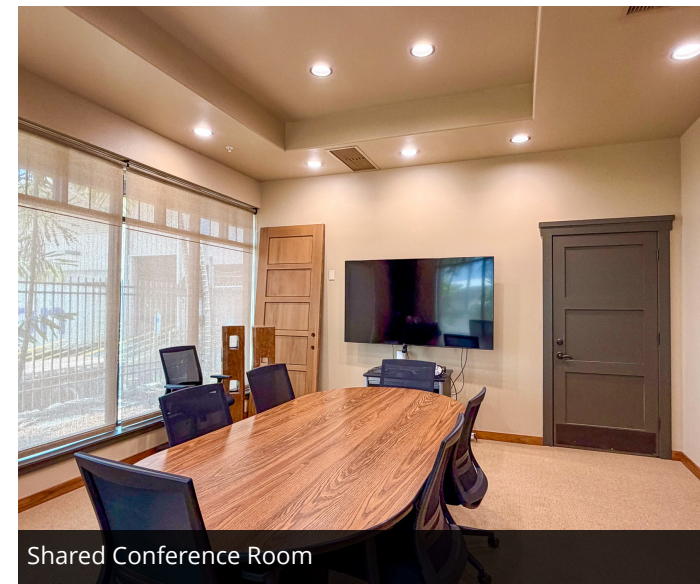
Shared Conference Room