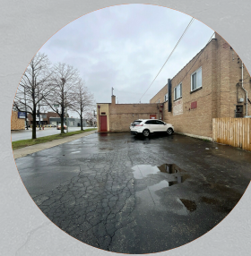
Rare Size Offering with Functional Parking