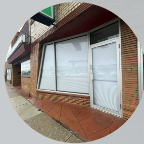
Attractive Storefront with Versatile Appeal