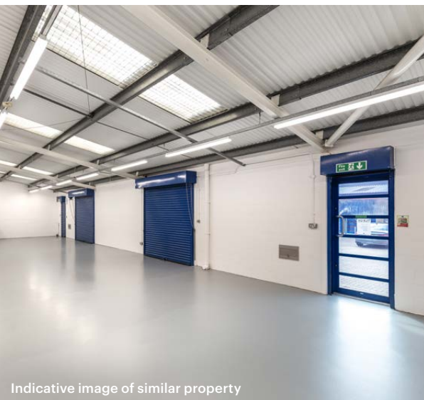
Indicative image of similar property