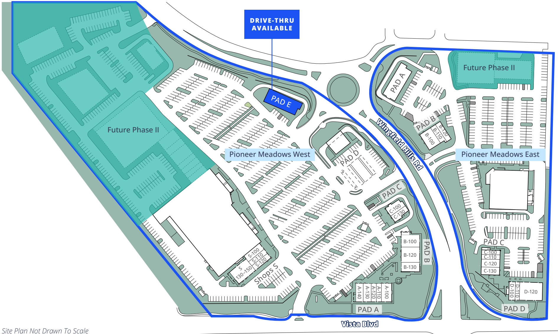
Site Plan Not Drawn To Scale