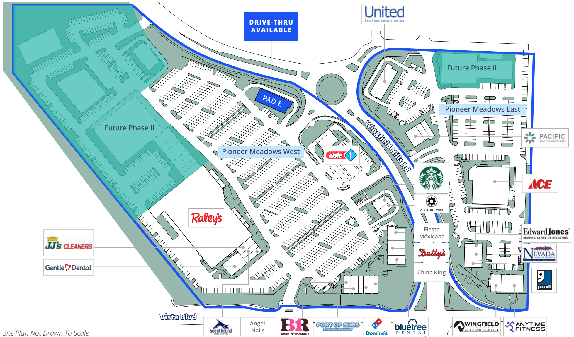
Site Plan Not Drawn To Scale