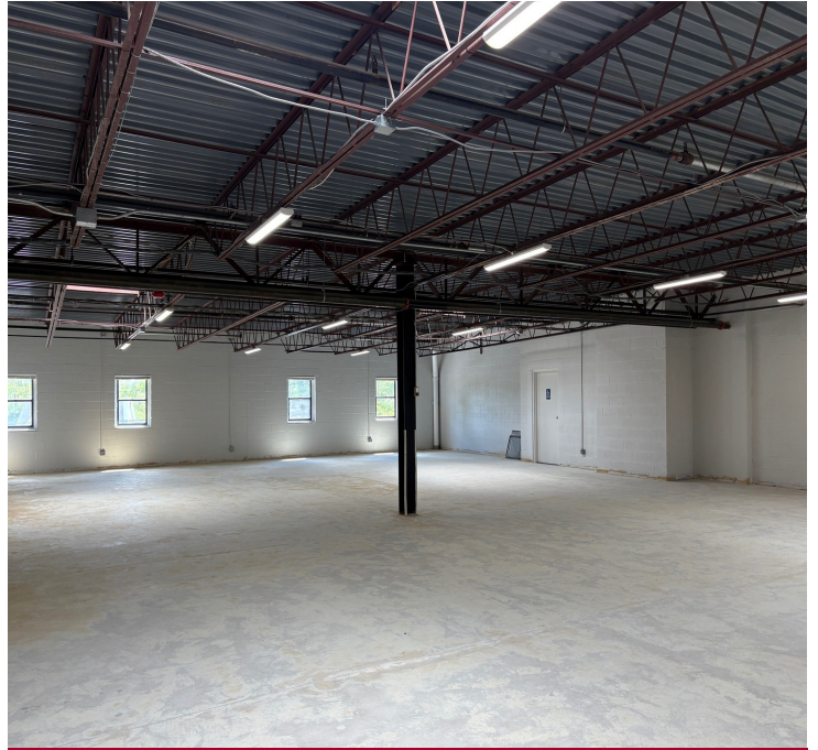
STE E2 - 2nd Floor