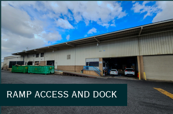
RAMP ACCESS AND DOCK

2312 KAMEHAMEHA HWY. BUILDING F, HONOLULU, HI, 96819