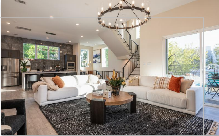
911 - The Pinnacle - Where Heights Meet Comfort