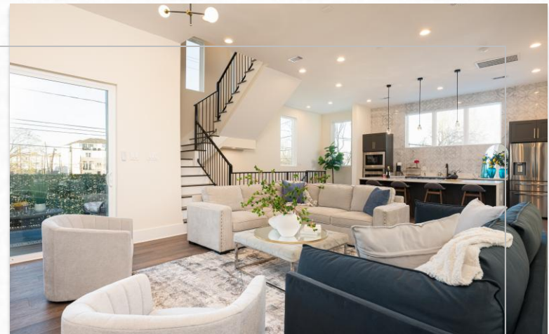
917 - The Horizon - Endless Views & Infinite Luxury