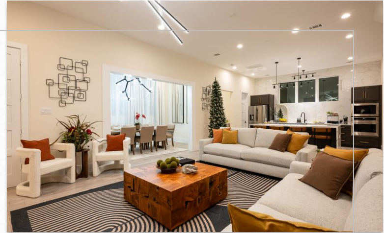
913 - The Eterne - Timeless Luxury