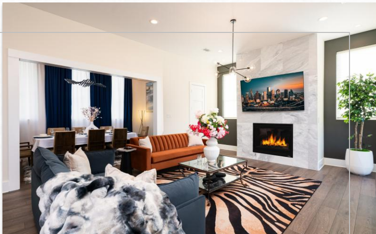
915 - The Onyx - Beauty Meets Elegance