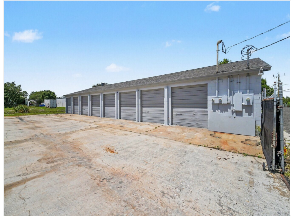
7731 Industrial Rd16