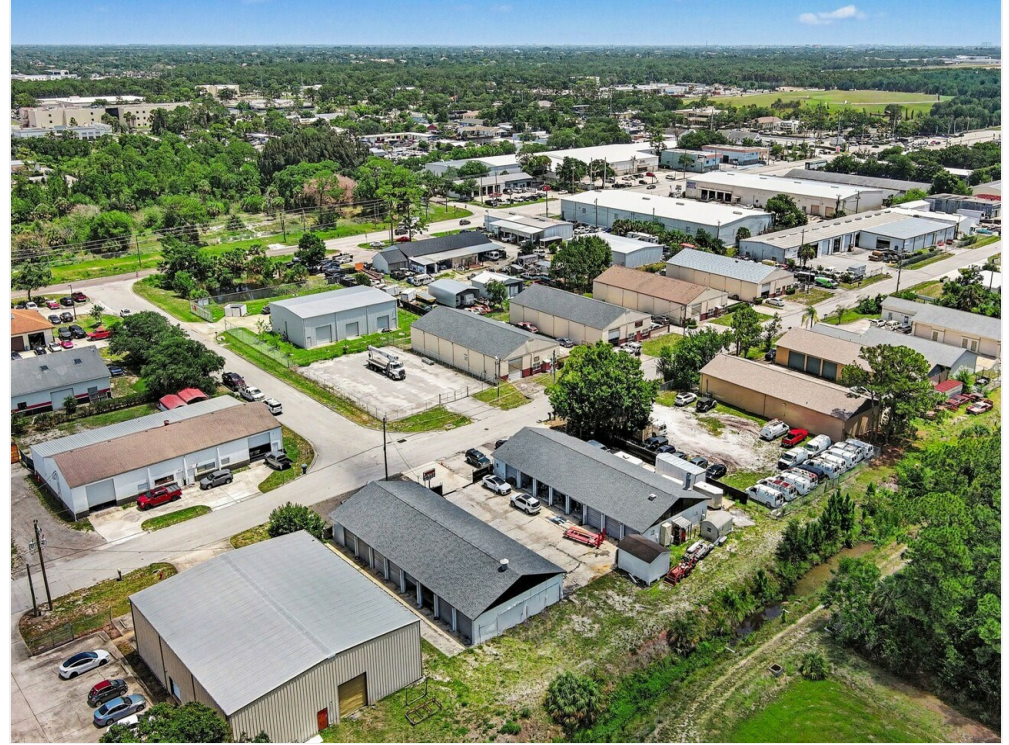
7731 Industrial Rd20