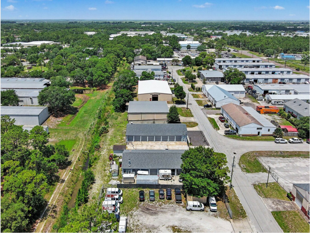
7731 Industrial Rd25