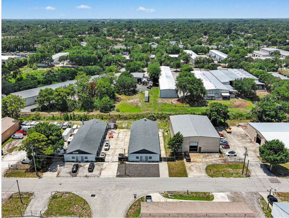
7731 Industrial Rd23