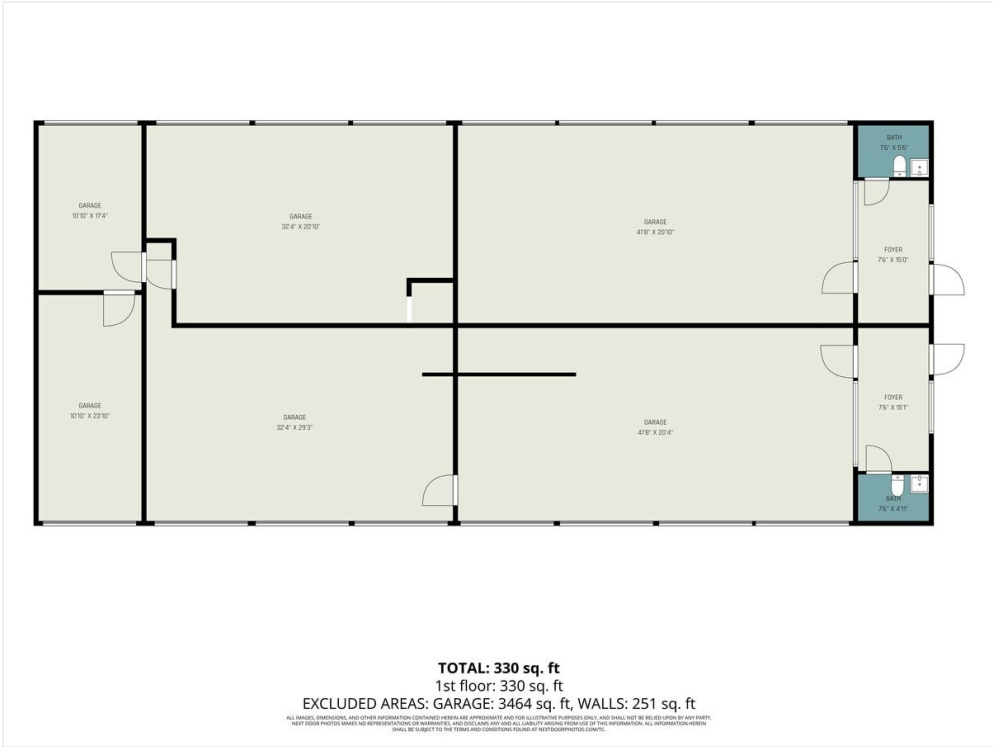
7731 INDUSTRIAL RD WEST MELBOURNE Floor Plan