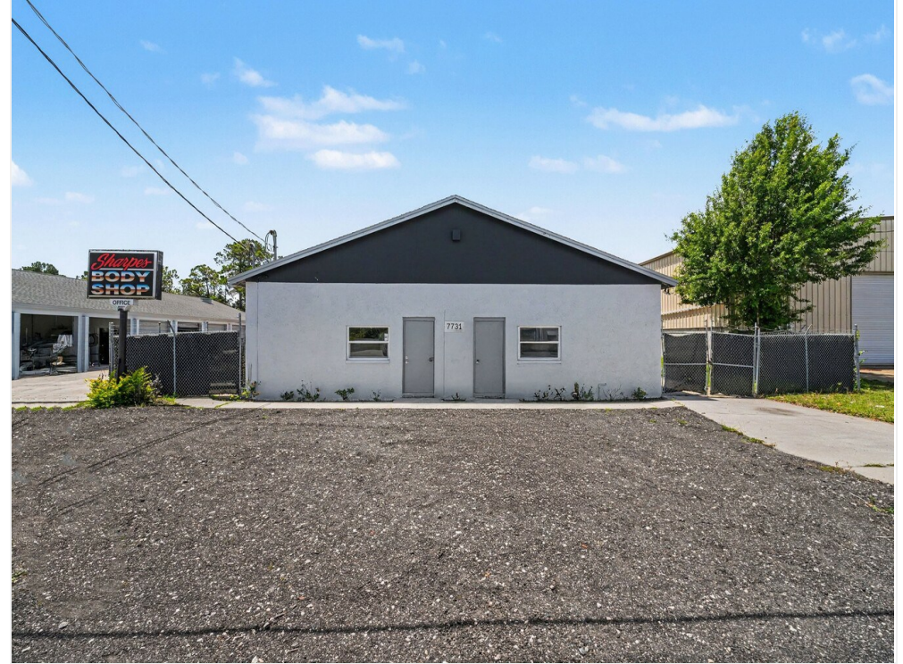
7731 Industrial Rd3