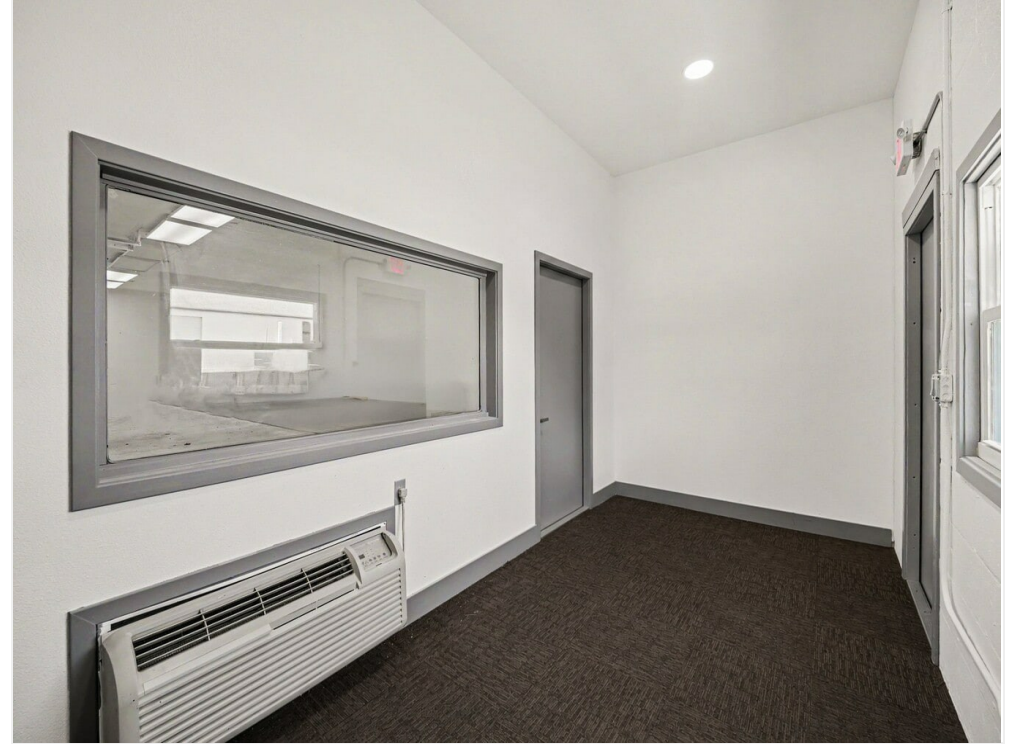
7731 Industrial Rd6