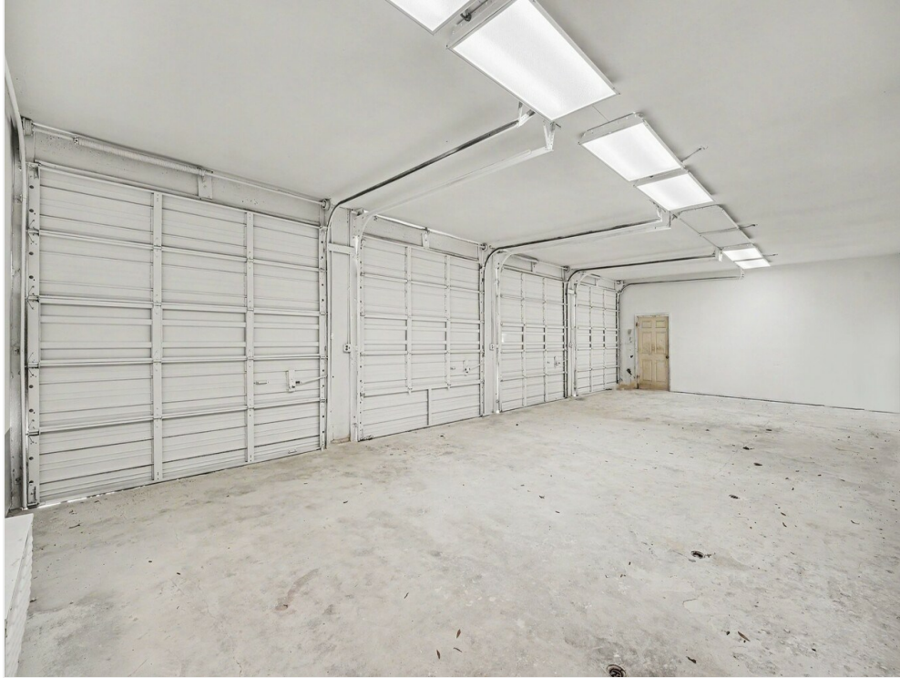
7731 Industrial Rd10