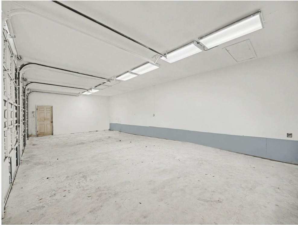
7731 Industrial Rd11