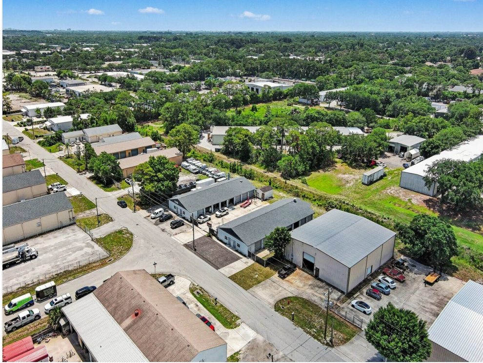
7731 Industrial Rd21