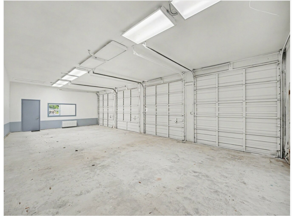
7731 Industrial Rd12