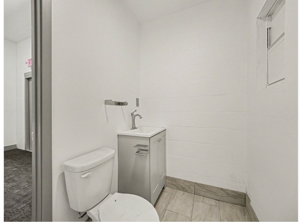
7731 Industrial Rd9