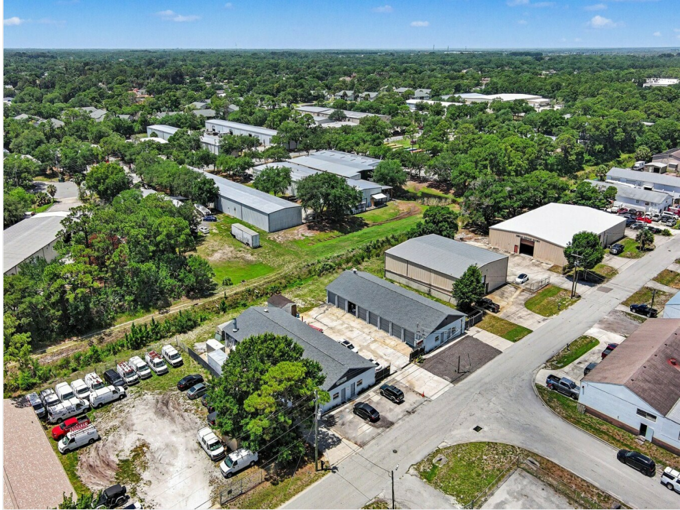
7731 Industrial Rd24