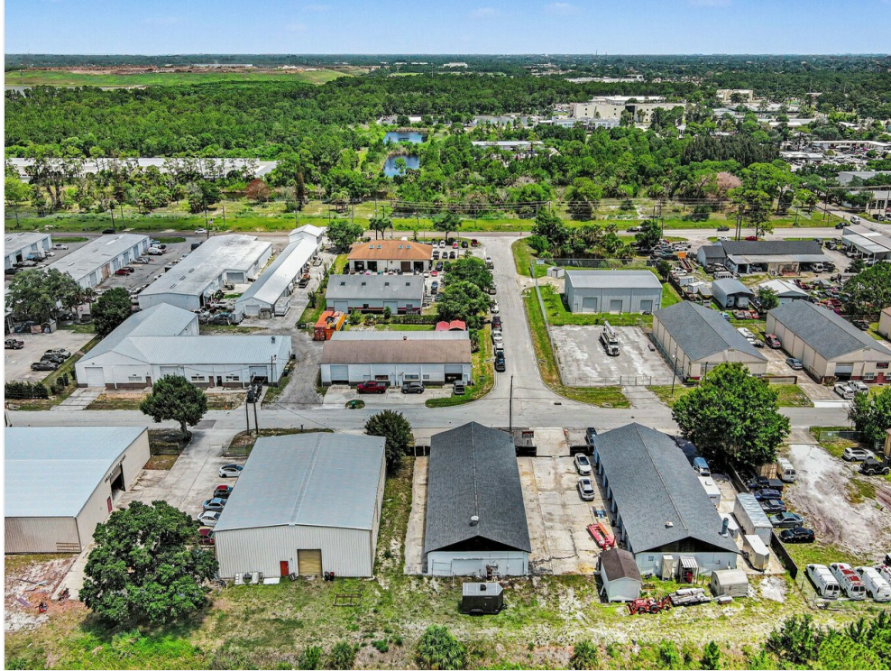
7731 Industrial Rd27