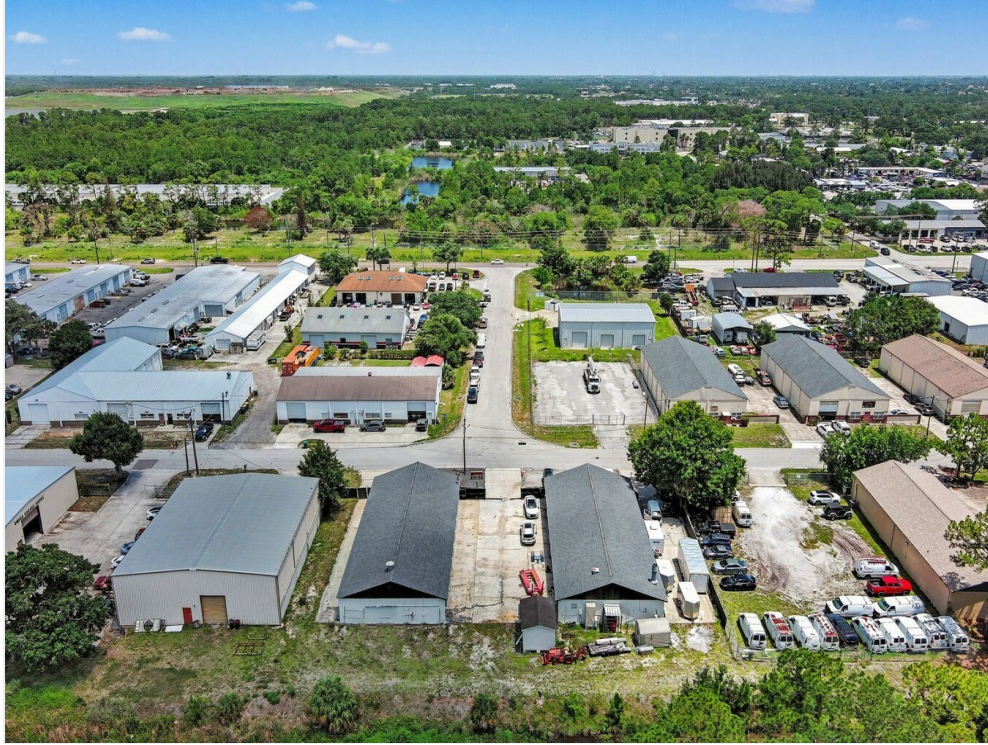
7731 Industrial Rd19