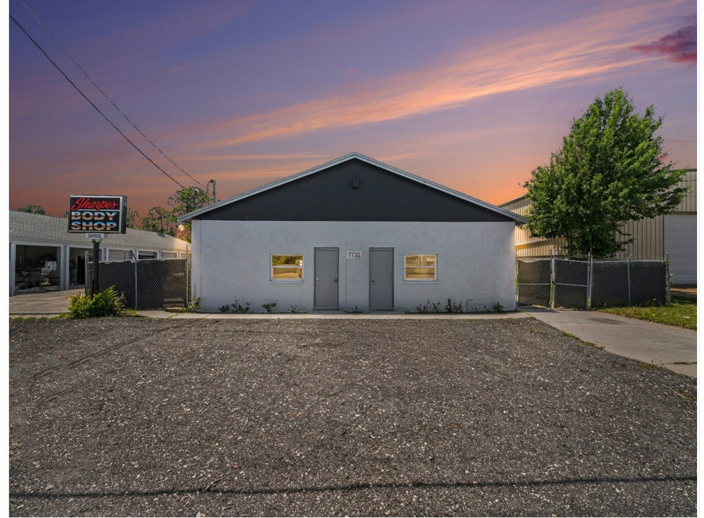
7731 Industrial Rd2