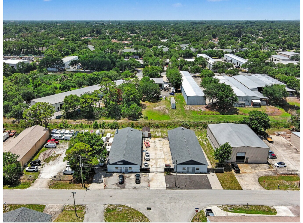
7731 Industrial Rd22