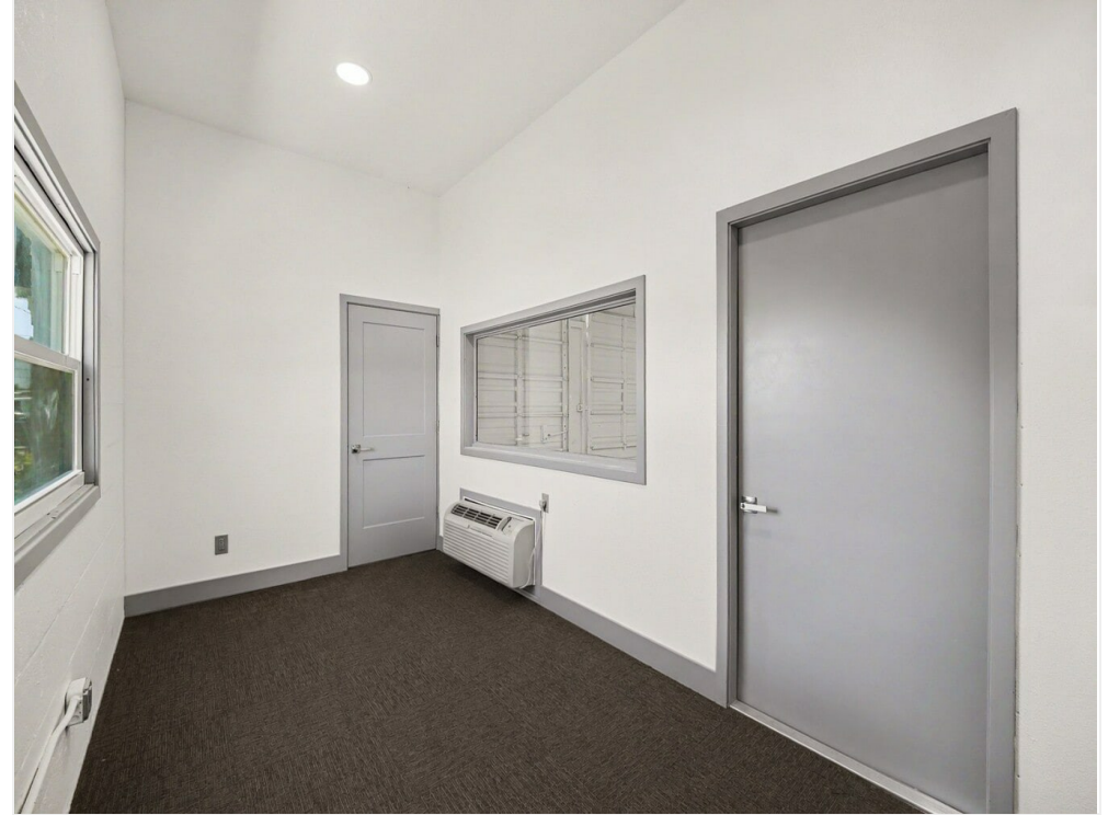
7731 Industrial Rd7