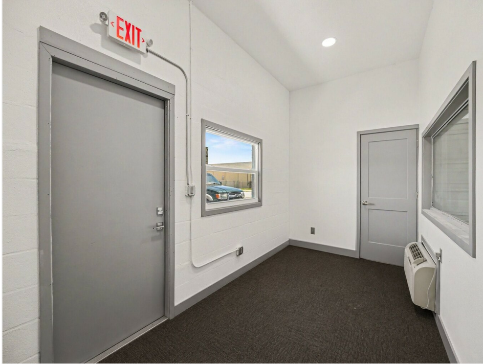
7731 Industrial Rd8