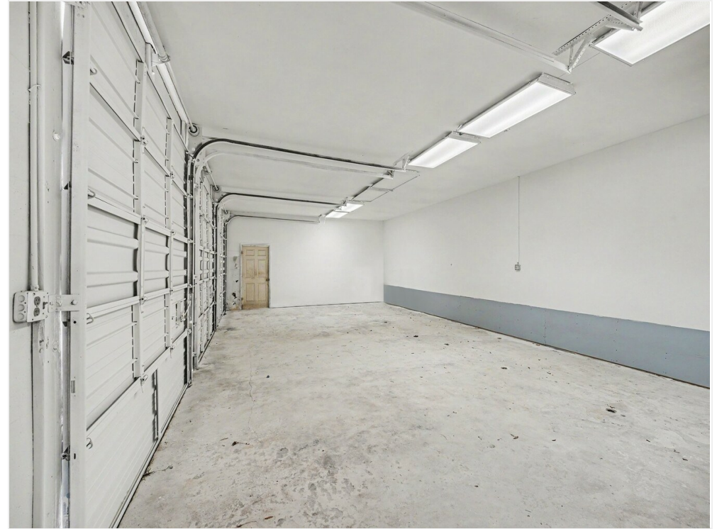
7731 Industrial Rd14