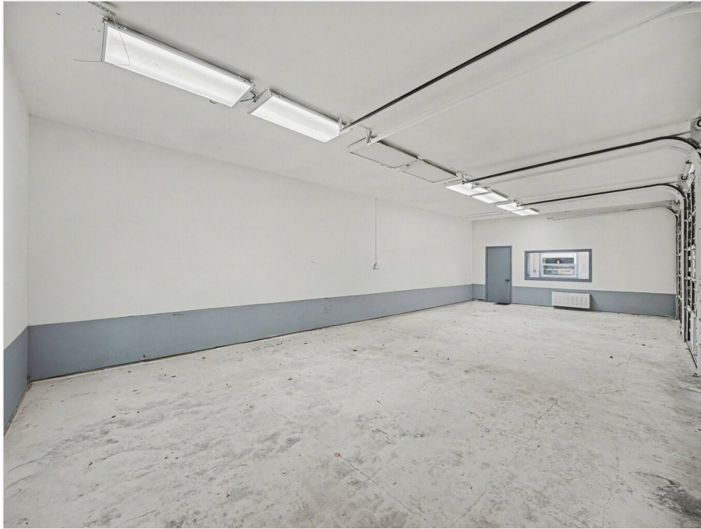
7731 Industrial Rd13