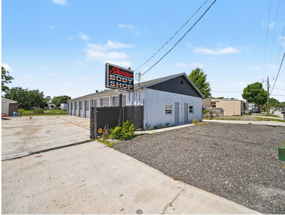
7731 Industrial Rd5