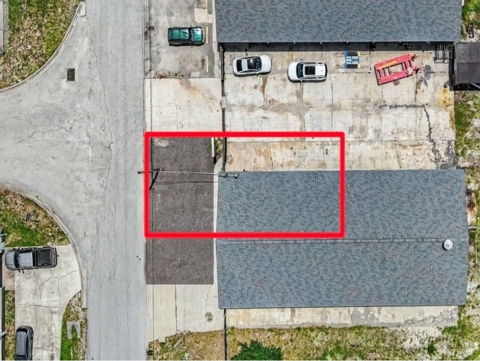
Available Leased Area