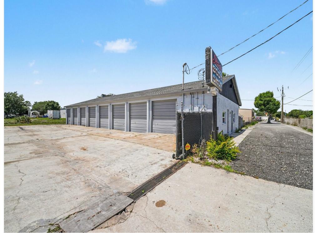
7731 Industrial Rd18