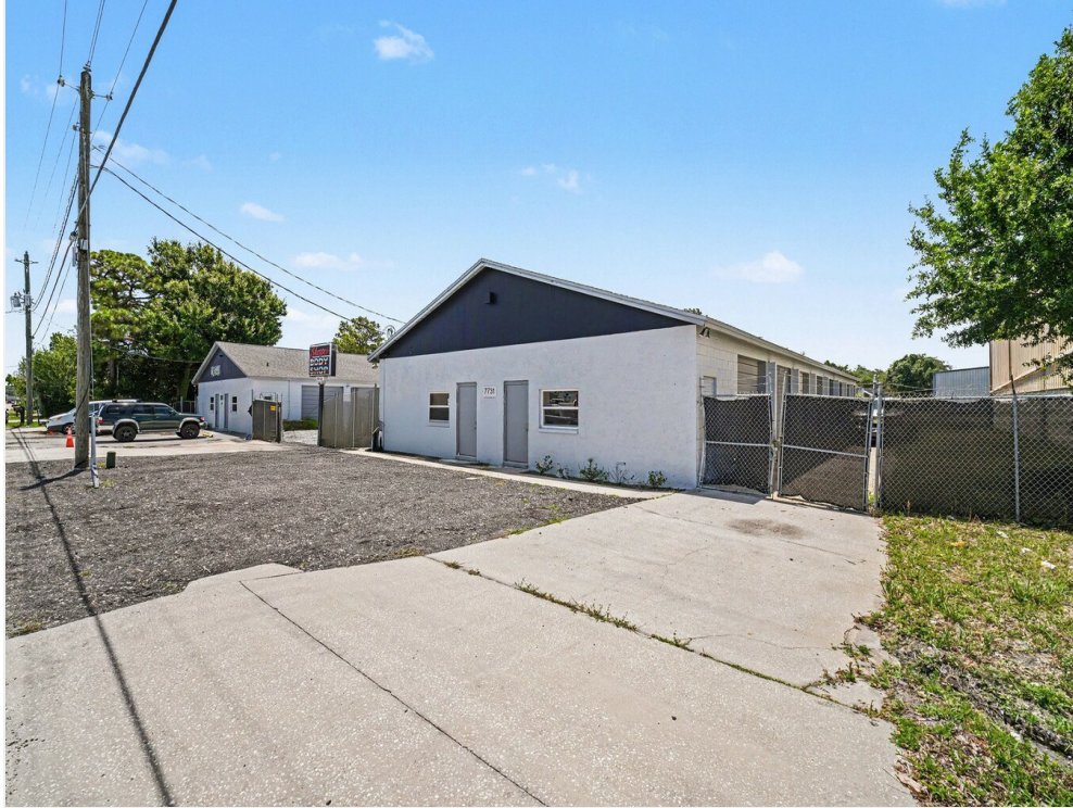
7731 Industrial Rd4