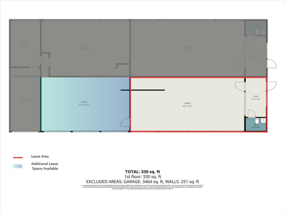
7133 Industrial Floor Plan Redlined