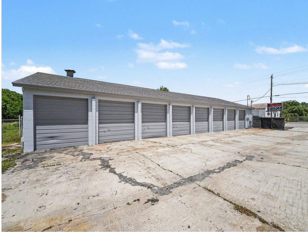
7731 Industrial Rd17