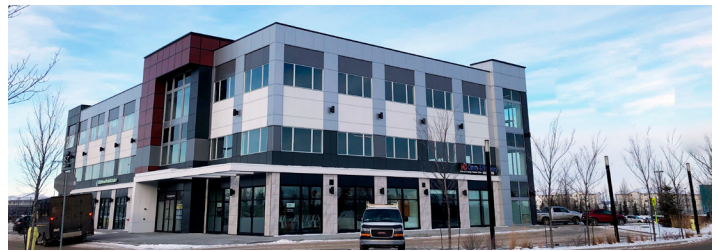
TRI WELLNESS PROFESSIONAL BUILDING