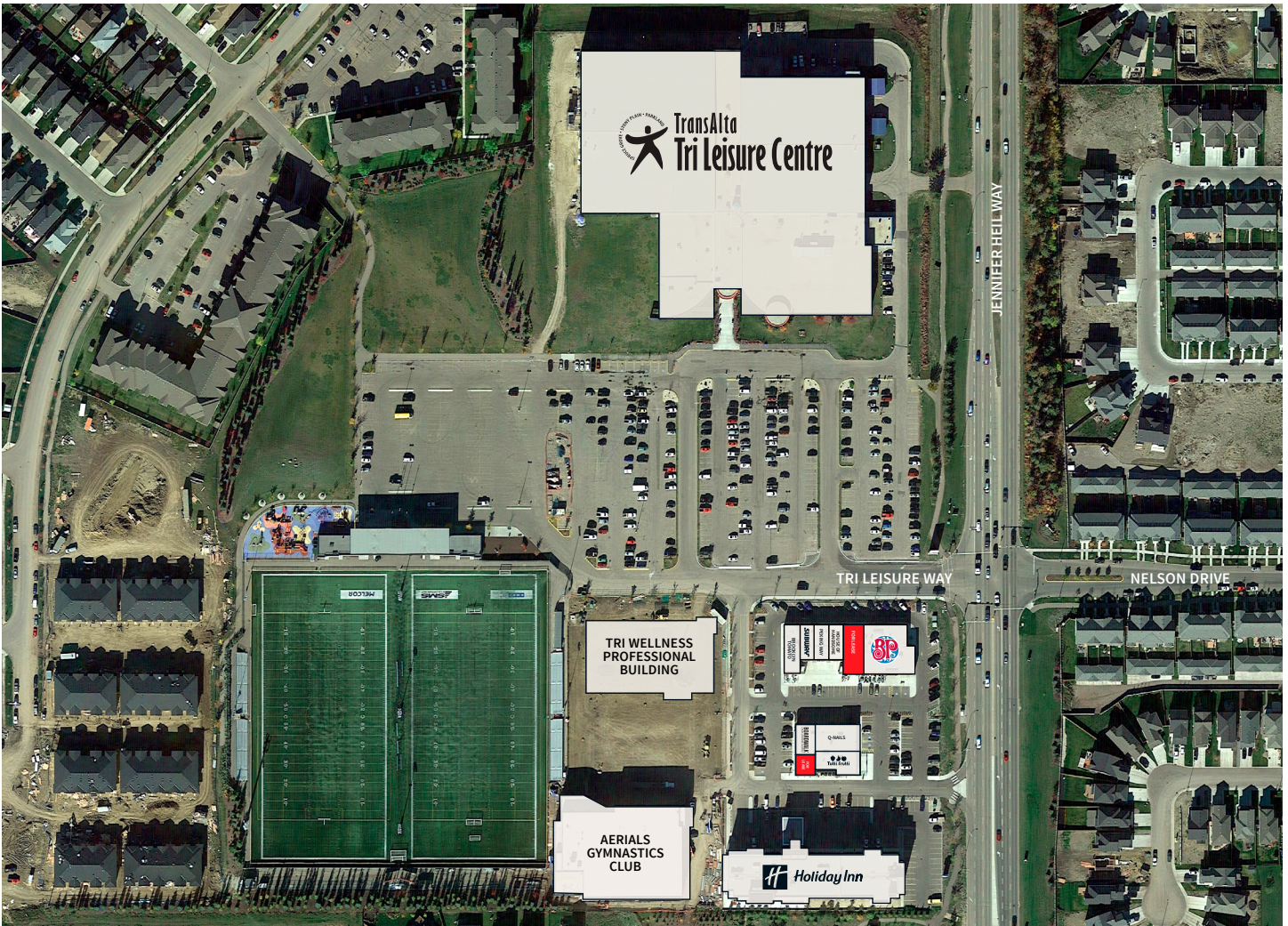
TRI LEISURE CENTRE AERIAL