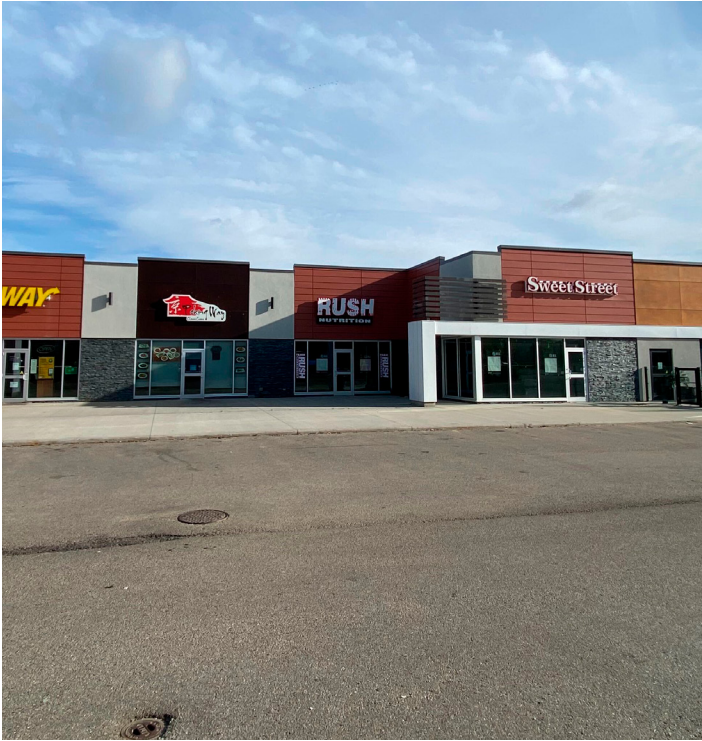
FOR LEASE — Former Sweet Street (1,962 SF) and former Rush Nutrition (1,380 SF)

For Lease — Tri Leisure Village, Spruce Grove