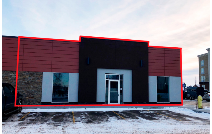
FOR LEASE — 932 SF