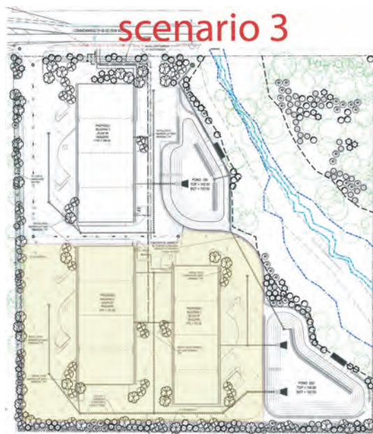
35,000 SF with highlighted area fenced