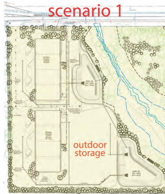
50,000 SF with +/- 2 acres outside storage

Closest industrial site to I-10 in Leon County. Up to +/- 7 acres of industrial outdoor storage (IOS) available. Permitted for 70,000 sf, but will build to suit with as little as 10,000 SF with the balance of the site being fenced industrial outdoor storage.