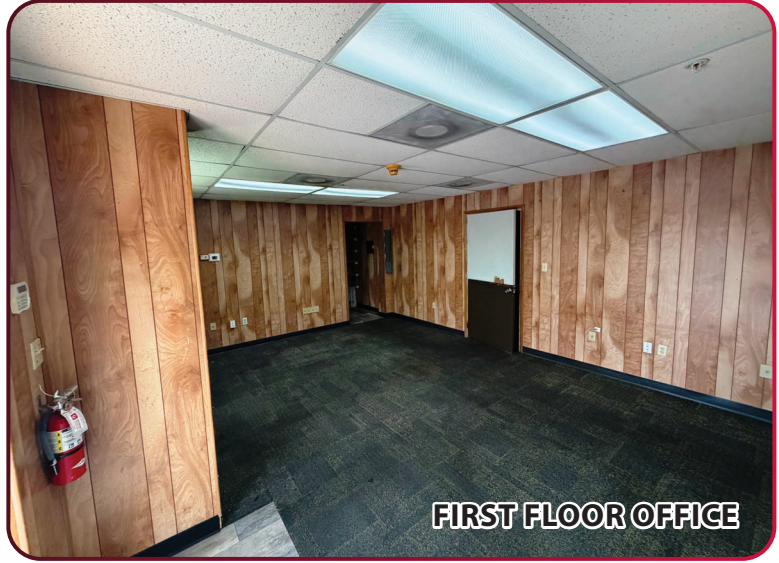
FIRST FLOOR OFFICE