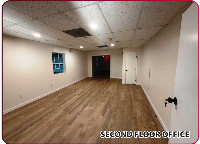
SECOND FLOOR OFFICE