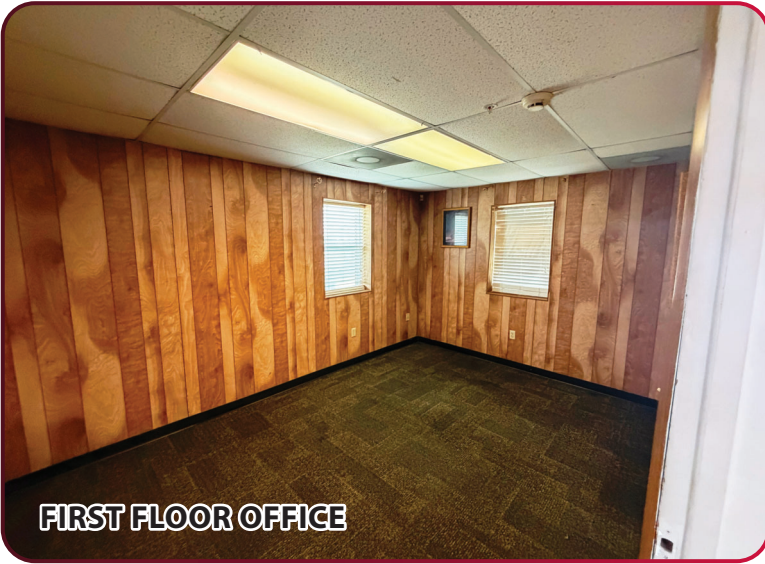
FIRST FLOOR OFFICE