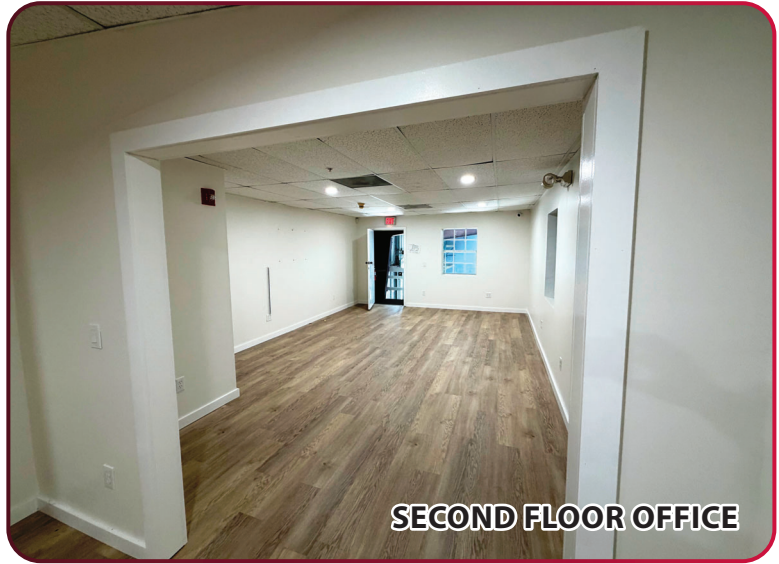
SECOND FLOOR OFFICE