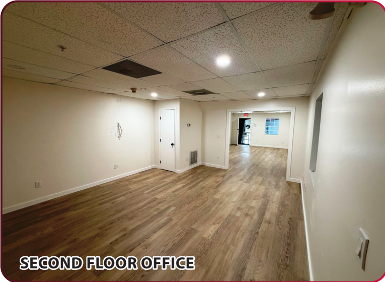
SECOND FLOOR OFFICE