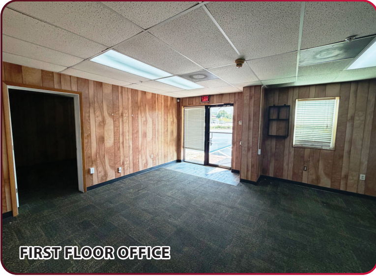
FIRST FLOOR OFFICE