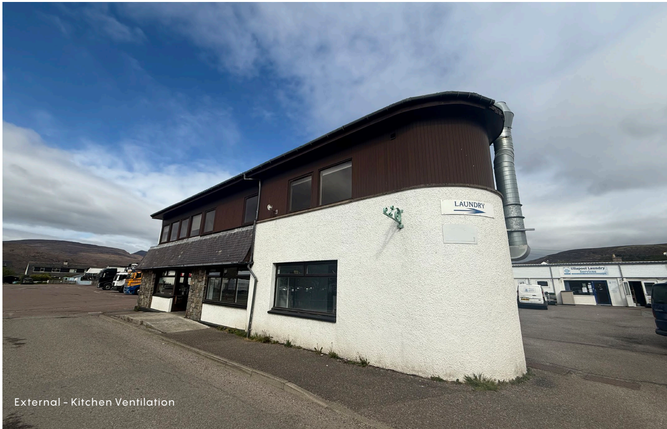
External - Kitchen Ventilation