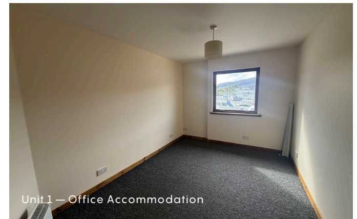
Unit 1 - Office Accommodation