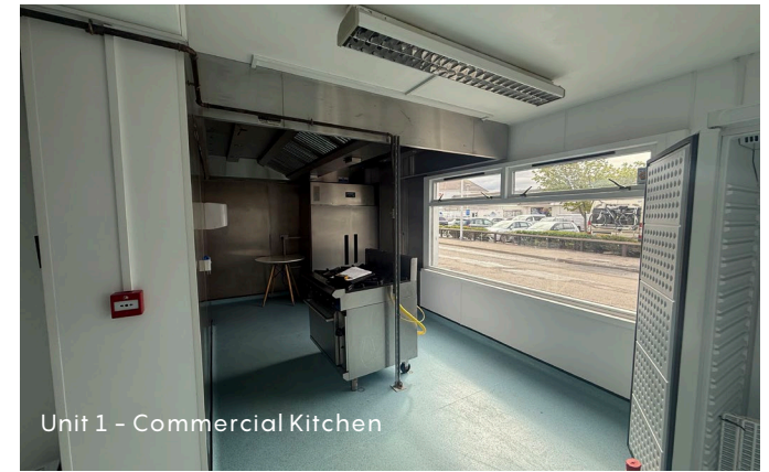
Unit 1 - Commercial Kitchen