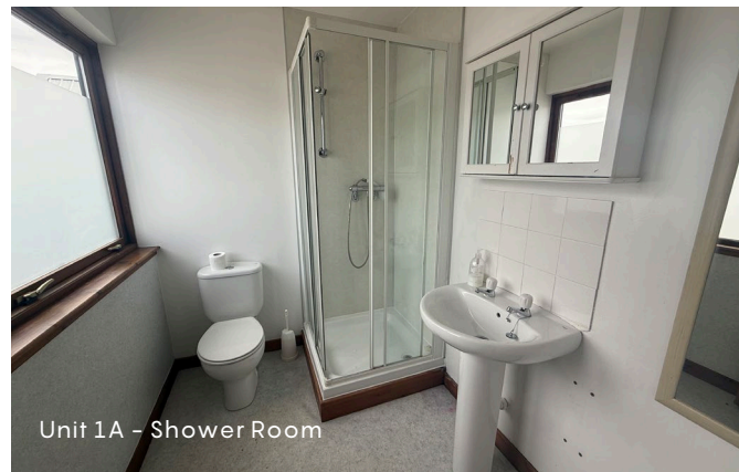
Unit 1A - Shower Room