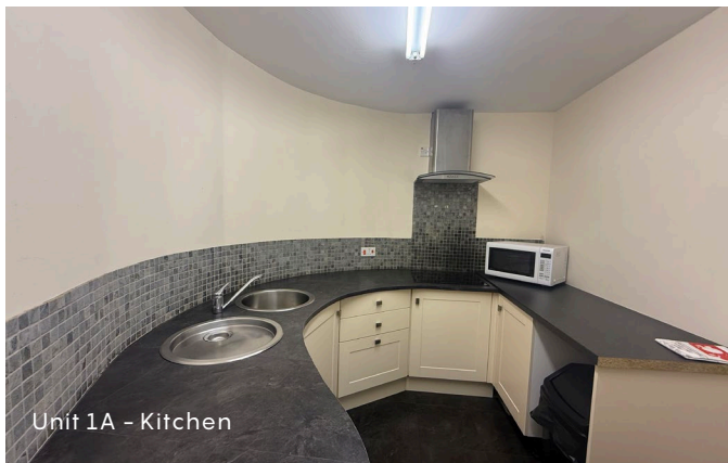
Unit 1A - Kitchen