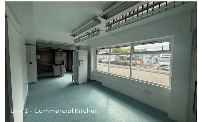
Unit 1 - Commercial Kitchen