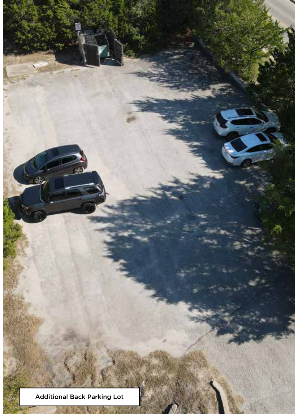
Additional Back Parking Lot