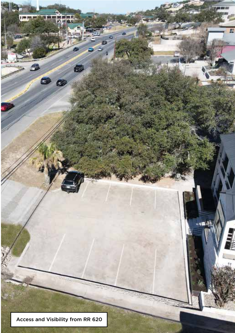
Access and Visibility from RR 620