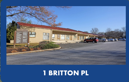
1 BRITTON PL