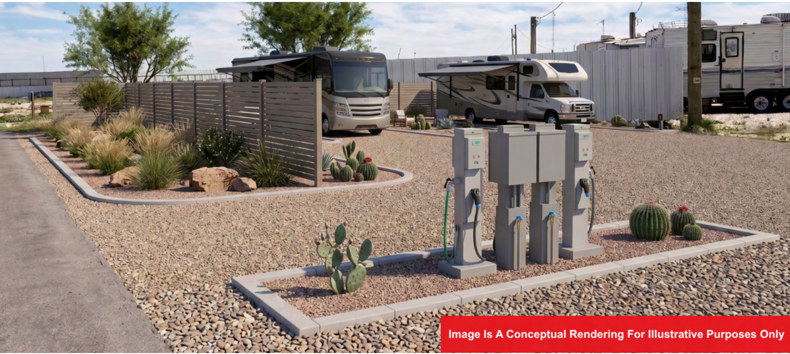
Image Is A Conceptual Rendering For Illustrative Purposes Only