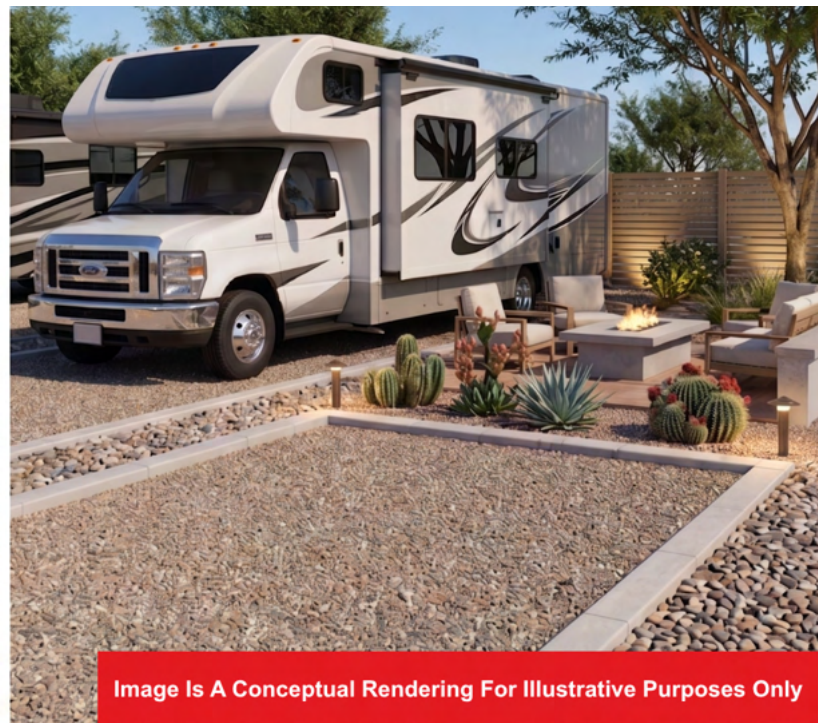
Image Is A Conceptual Rendering For Illustrative Purposes Only