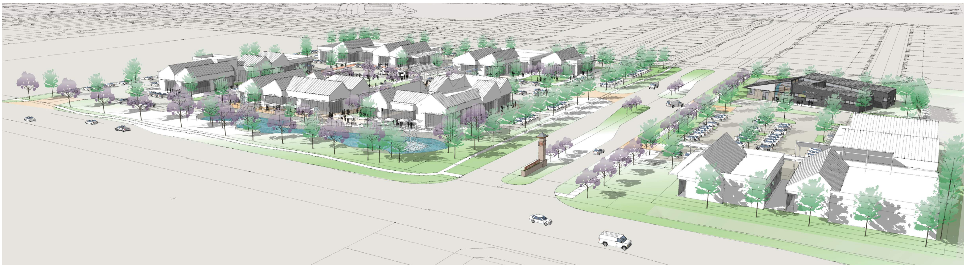
View from Southeast