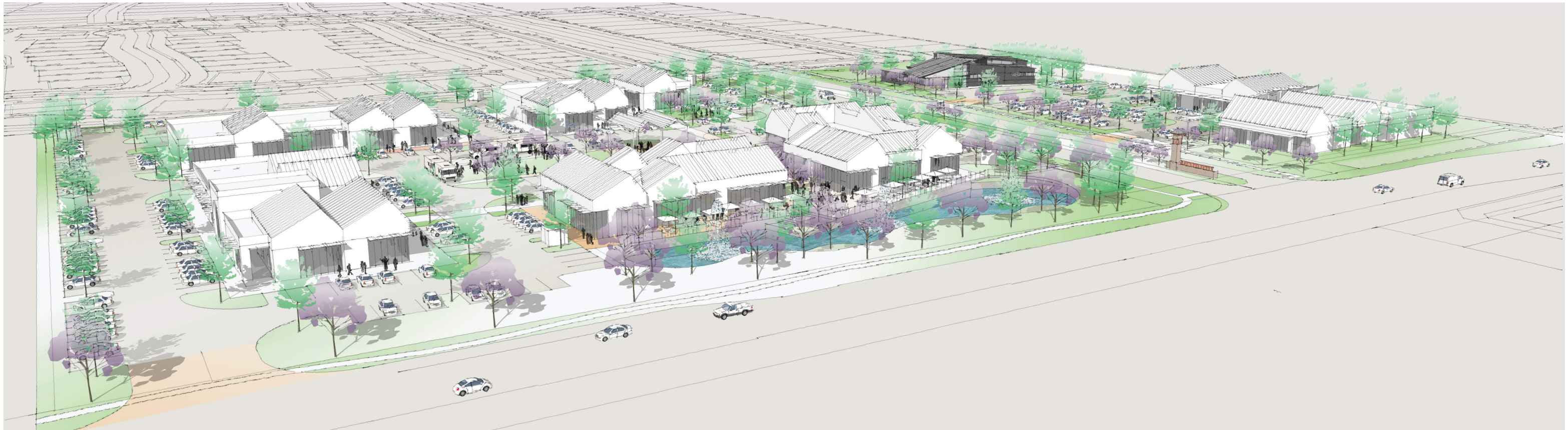
View from Southwest