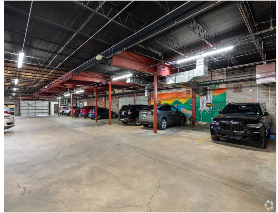
Secure Parking Garage