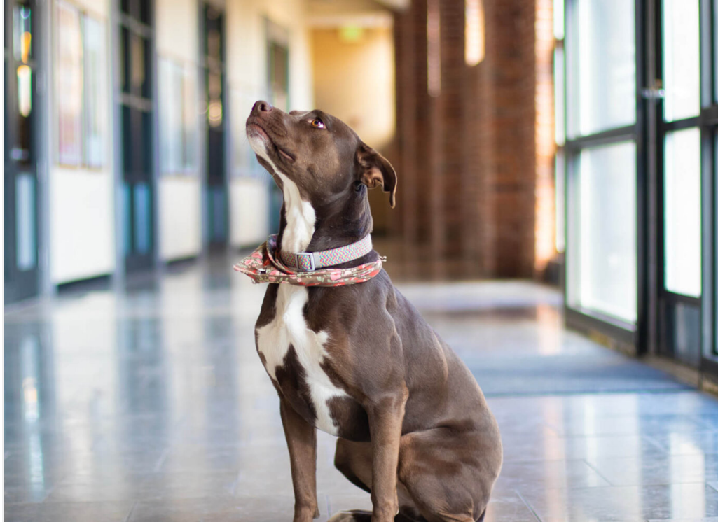
Reggie in our East Lobby