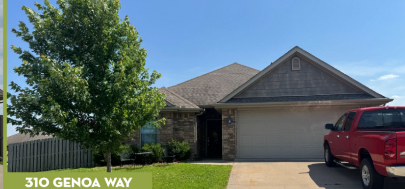
310 GENOA WAY