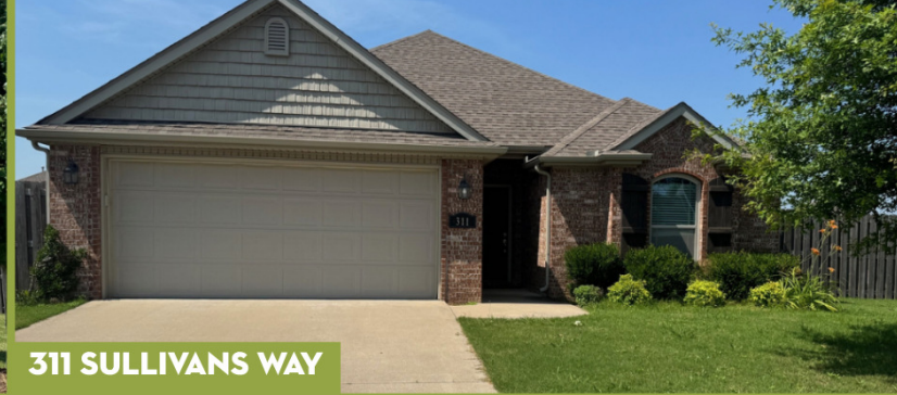
311 SULLIVANS WAY