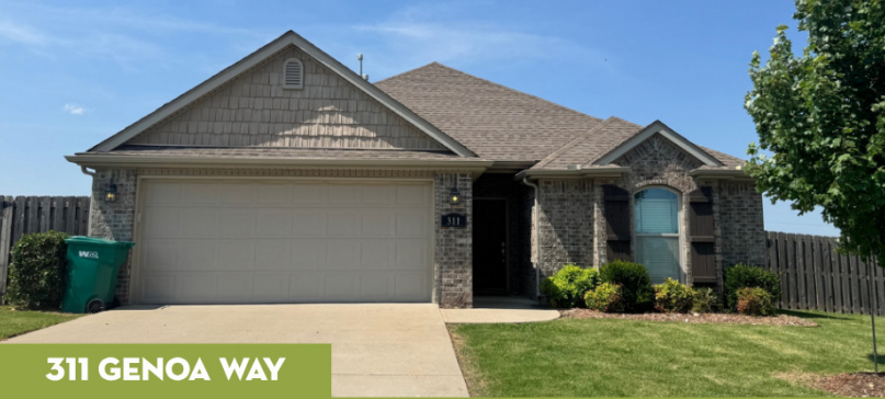
311 GENOA WAY