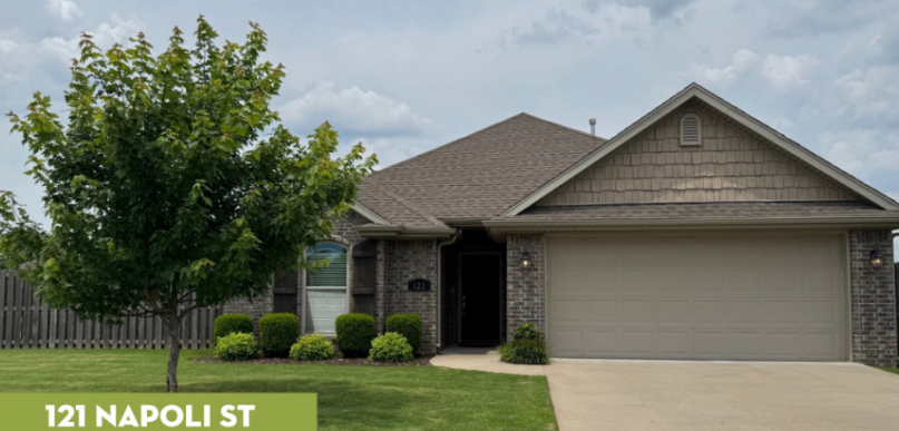
121 NAPOLI ST