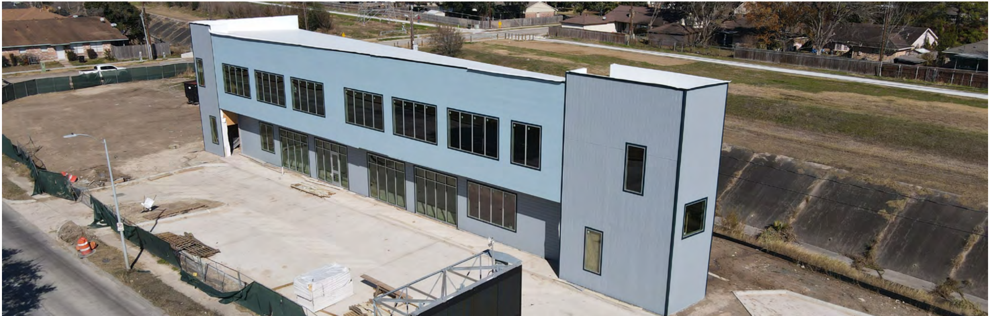
Construction Progress Feb 2025