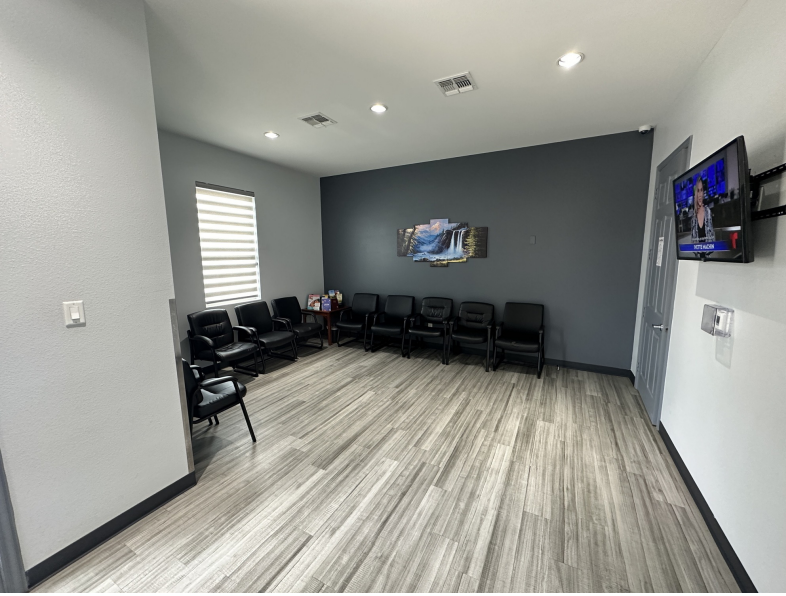
Shared Waiting Room