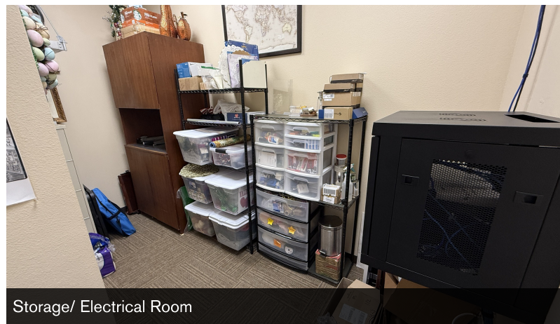
Storage/ Electrical Room