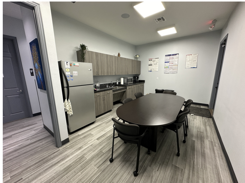
Shared Break Room