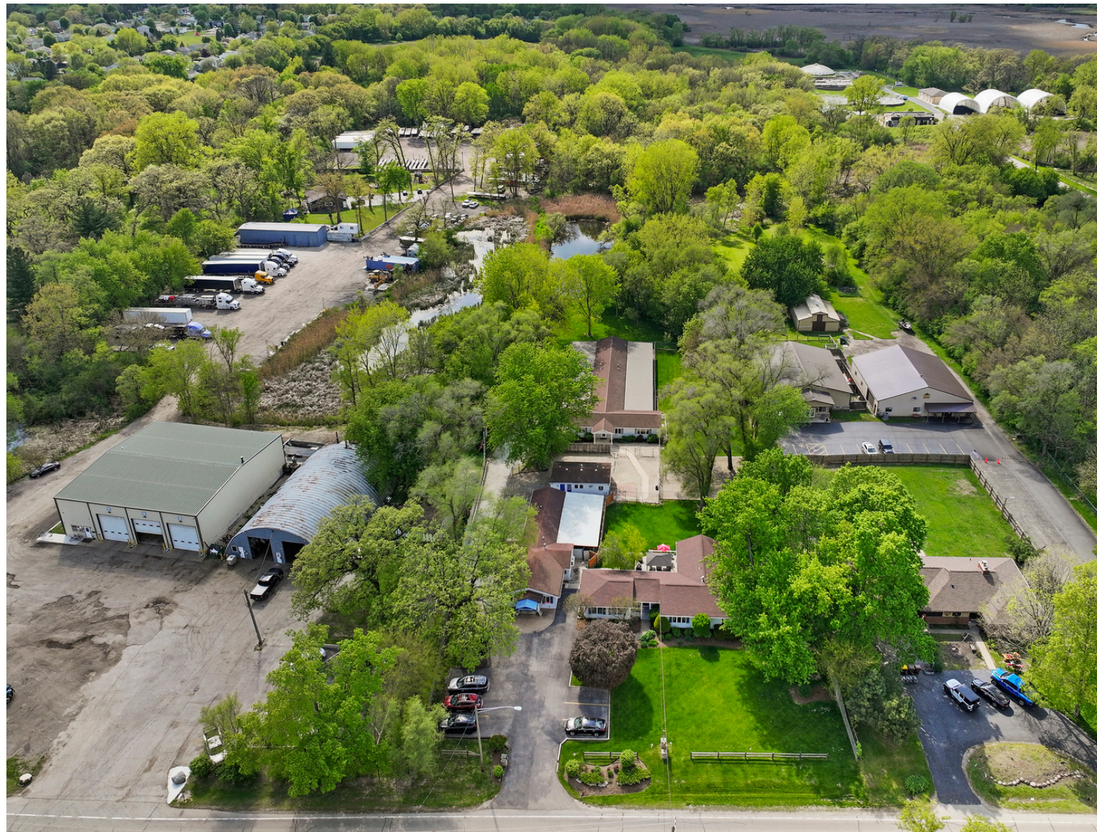
4403 ROBERTS ROAD

Live where you work-or step into an incredible opportunity to own a fully operational business, residential home, and commercial property all in one. Situated on nearly 5 private acres in unincorporated McHenry County, this well-established dog kennel operation offers 5,827 square feet of kennel space with 56 indoor/outdoor runs, including suite-style accommodations-with plenty of room to grow. The setup includes a welcoming reception area, dedicated feline boarding room, grooming spaces, laundry, and ample storage. There's also an additional outbuilding with 16 indoor/outdoor runs, opening the door for expansion or your own creative use. With the land and layout, there's potential to scale up to 100 runs. For the human side of things, the property features a beautifully updated ranch home-ideal for an onsite owner/operator or manager. The home offers an open floor plan with granite countertops, stainless steel appliances, updated bathrooms, and a newer roof (2018). This is more than just a property-it's a lifestyle opportunity for someone who loves animals and wants to own a business with room to grow, all while enjoying the privacy and flexibility of rural acreage.