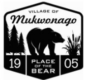
FIGURE #1 RIGHT-OF-WAY ACQUISITION FOR IMPROVEMENTS MEACHAM STREET AND PLEASANT LANE VILLAGE OF MUKWONAGO WAUKESHA/ WALWORTH COUNTIES, WISCONSIN