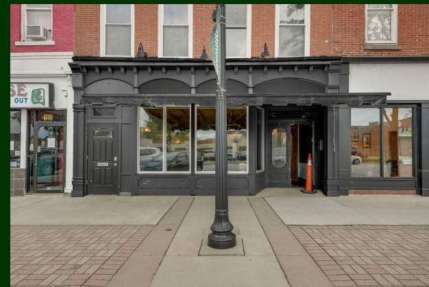
154 Main St., Painesville, OH 44077

No warranty or representation, express or implied, is made as to the accuracy of the information contained herein. It is submitted subject to errors, omissions, price changes, rental or other conditions, withdrawal without notice, and to any special listing conditions imposed by our client.