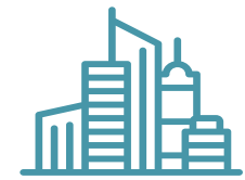
# OF BUSINESSES