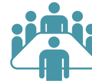
# OF EMPLOYEES