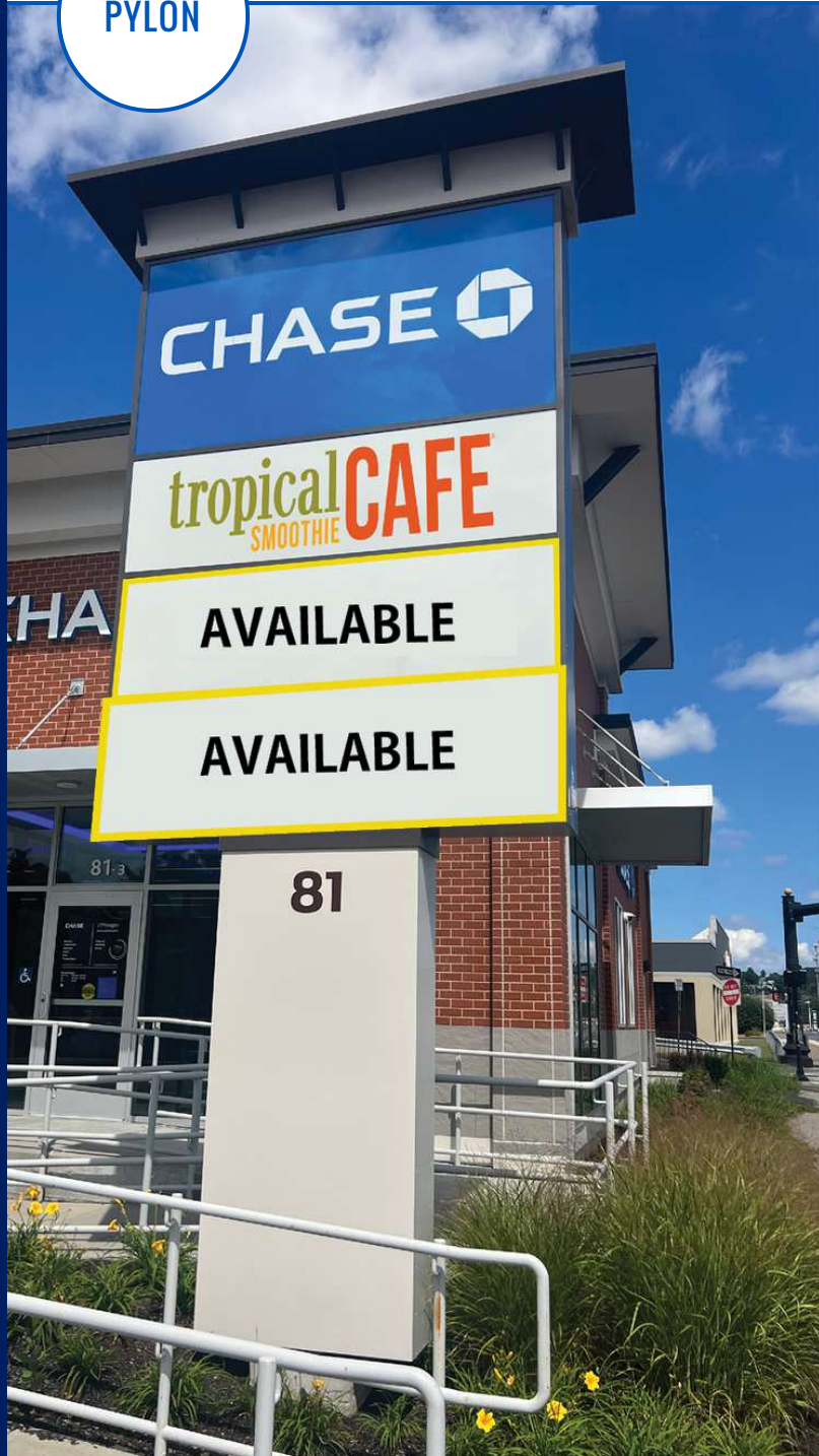
VIEW FROM GOLDSTAR BLVD