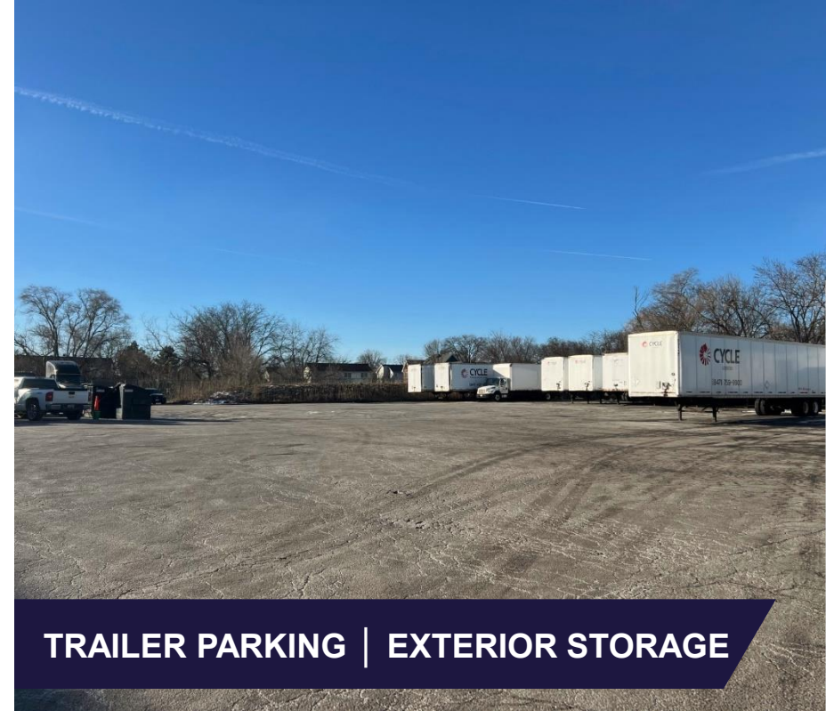
TRAILER PARKING | EXTERIOR STORAGE