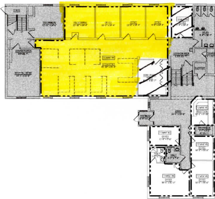
EXISTING 1st FLOOR PLAN SCALE: 1/8" = 1'-0"

DATE: 11/10/10 DRAWN BY: [Blank] CHECKED BY: [Blank] APPROVED BY: [Blank]