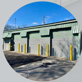
3 OVERHEAD DOORS