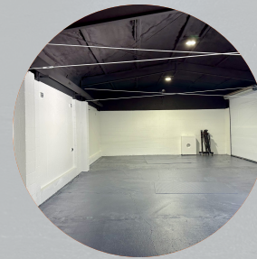
LARGE OPEN SPACE