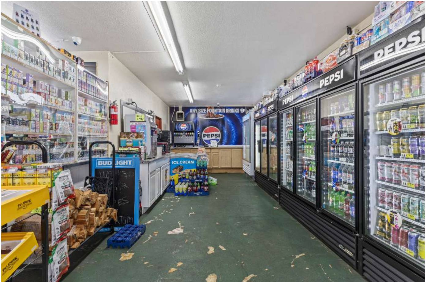
Unit A — Fountain Drink Station & Beverage Cooler Wall

Unit A is the primary retail storefront currently operating as Elite Market 2 — an active convenience and grocery store open 24/7. The unit features high-visibility Newmark Avenue frontage, large display windows, a full wall of commercial refrigeration and beverage coolers, ATM on-site, and dedicated exterior signage. This unit is currently leased and generating income. Lease details available upon request.