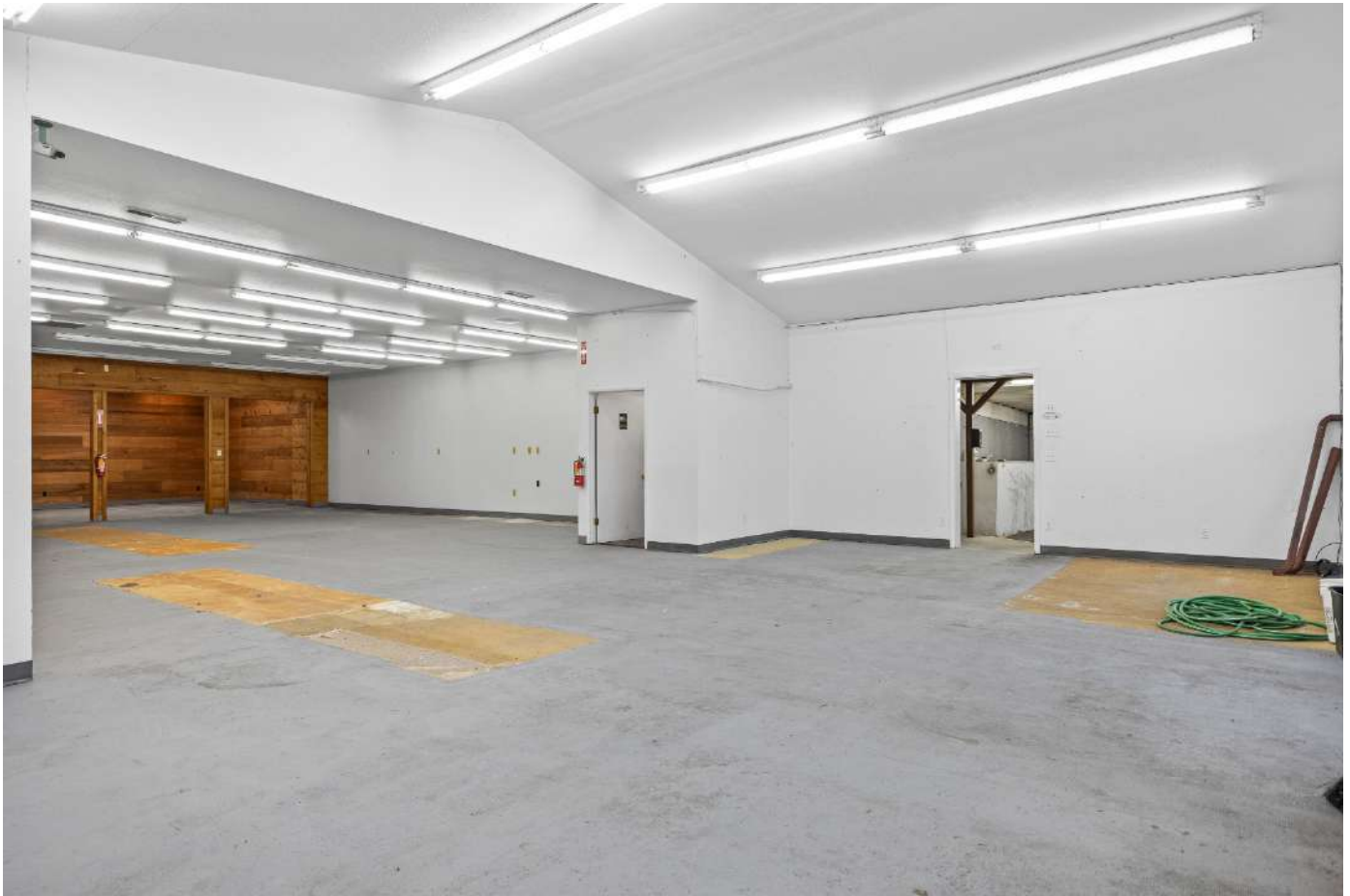
Unit B — Full Width View Showing Both Bays & Rear Passage