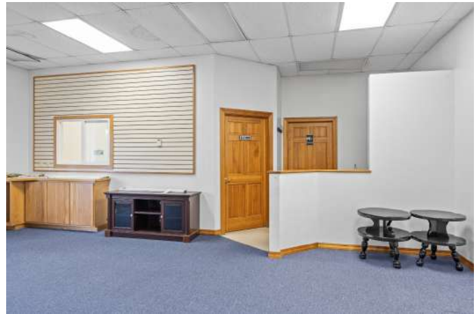
Unit C — Reception Lobby with Slatted Accent Wall, Office & Restroom Doors