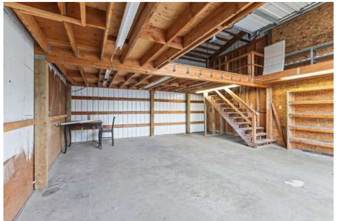
Unit C — Warehouse with Loft & Interior Staircase