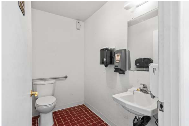
Unit B — ADA-Accessible In-Unit Restroom