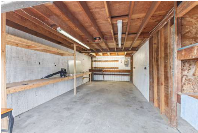
Unit C — Workshop Area with Pegboard Walls & Built-In Workbenches