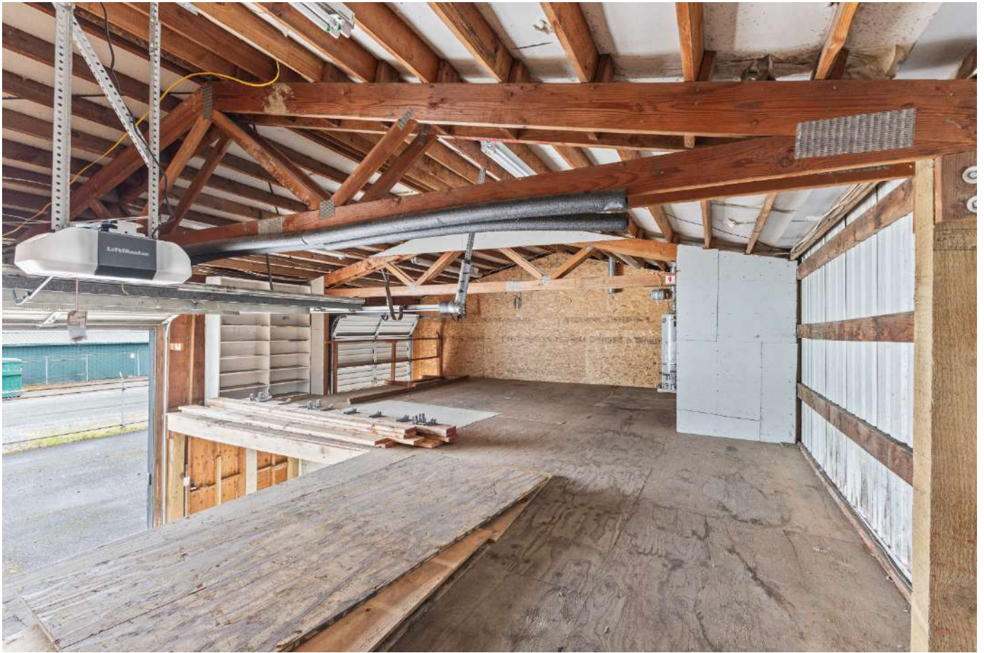
Unit C — At-Grade Loading Bay with LiftMaster Opener & Truck Door Access