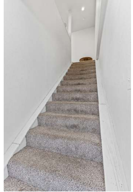
Private Staircase — Upper Apartment Access