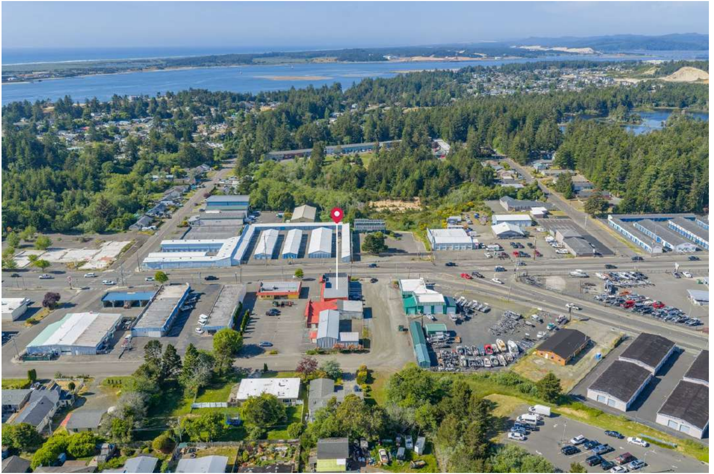
Aerial — Coos Bay Area Context with Property Pin (Coos Bay, North Bend & Bay Visible)