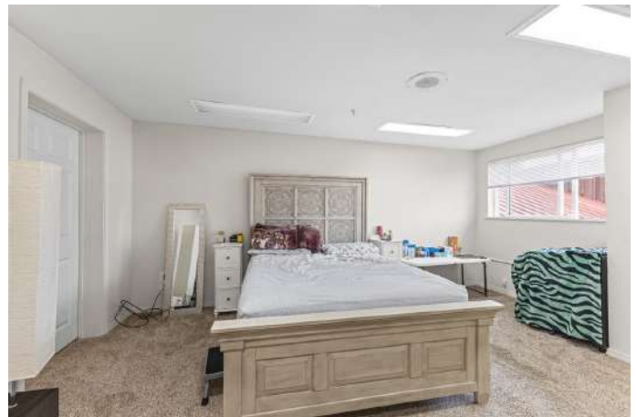
Apartment — Bedroom 2 (Carpeted, Natural Light)