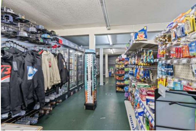
Unit A — Apparel & Snack Aisles