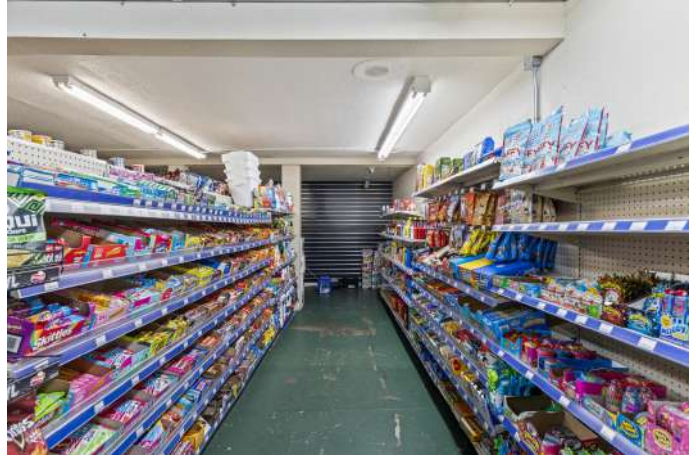
Unit A — Candy & Snack Aisle, Rear Roller Door