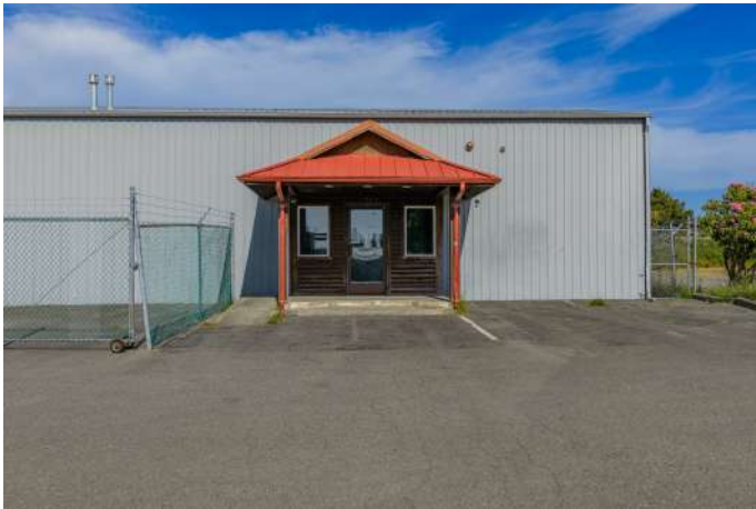
Unit C — Dedicated Covered Entry, Metal Siding & Secured Parking

Unit C spans ±3,115 SF across a fully built-out office suite and a connected warehouse/storage building — a rare combination of professional office space and hands-on work space in one unit. The office section features a covered front entry, reception lobby with slatted accent wall, private office room with built-in L-shaped granite counters, ADA restroom, and drop-tile ceilings throughout. The warehouse section includes a clear-span bay, workbench area with pegboard walls, loft with interior staircase, and at-grade truck door access with LiftMaster opener. This unit is vacant and available for immediate lease.