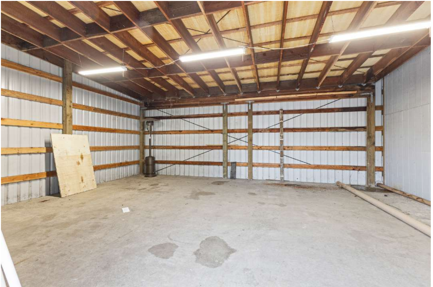
Unit C — Clear-Span Warehouse Bay with Concrete Floor & High-Bay Lighting