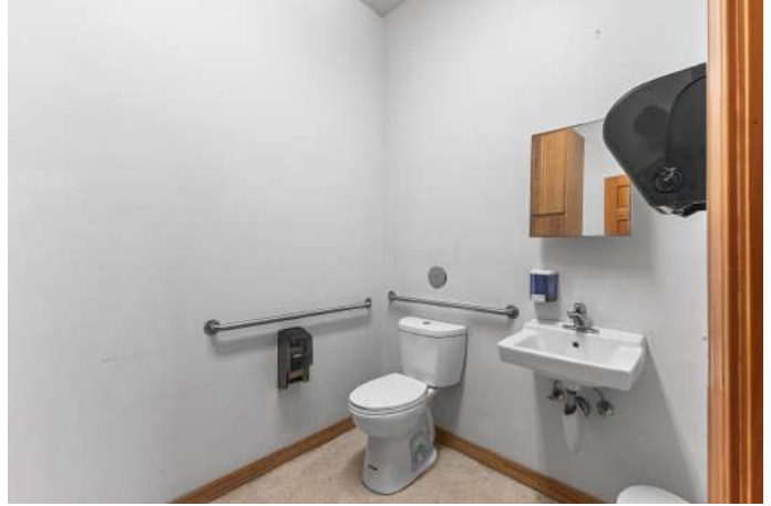
Unit C — ADA-Accessible Restroom with Grab Bars