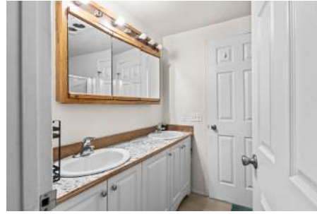
Bathroom — Double Vanity & Medicine Cabinet