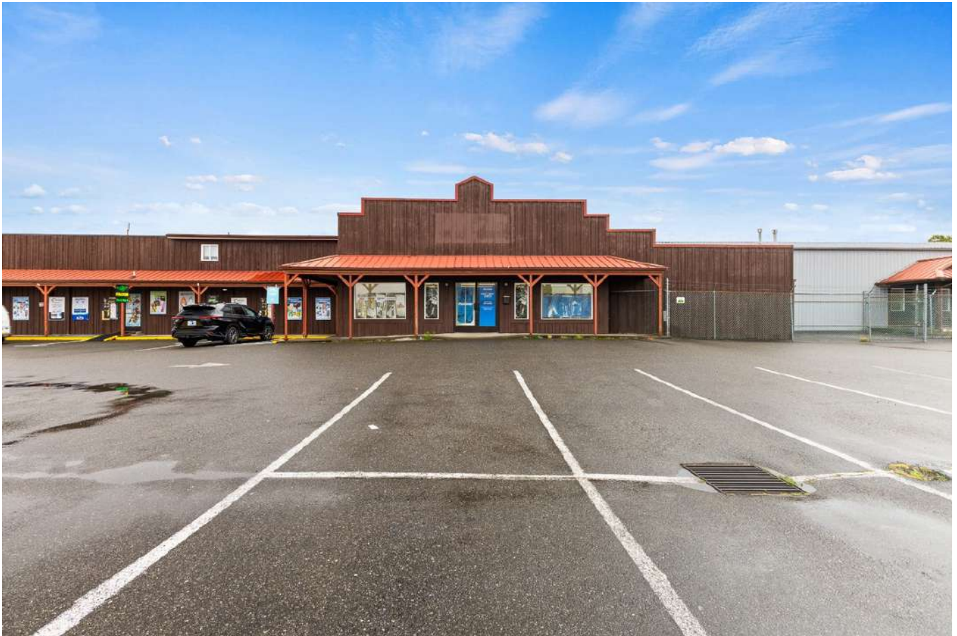
Exterior — Full Front Elevation, 1195 Newmark Ave