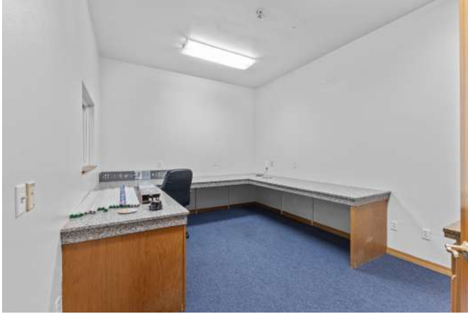
Unit C — Private Office with Built-In Granite L-Counter