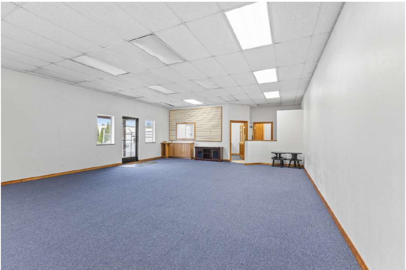
Unit C — Main Office Area with Drop-Tile Ceiling, Wood Accent Wall & Interior Doors