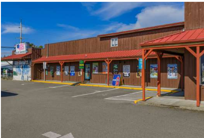
Street Level — Elite Market 2 / Newmark Ave Frontage