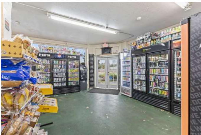
Unit A — Beverage Cooler Wall, ATM & Entry