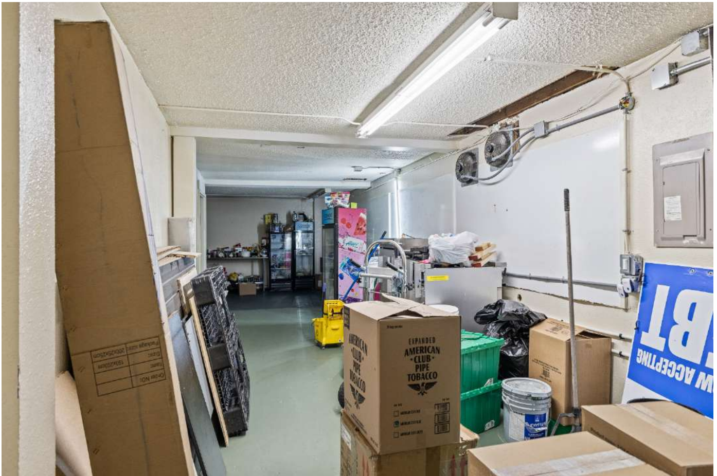
Unit A — Rear Storage & Prep Area with Commercial Equipment