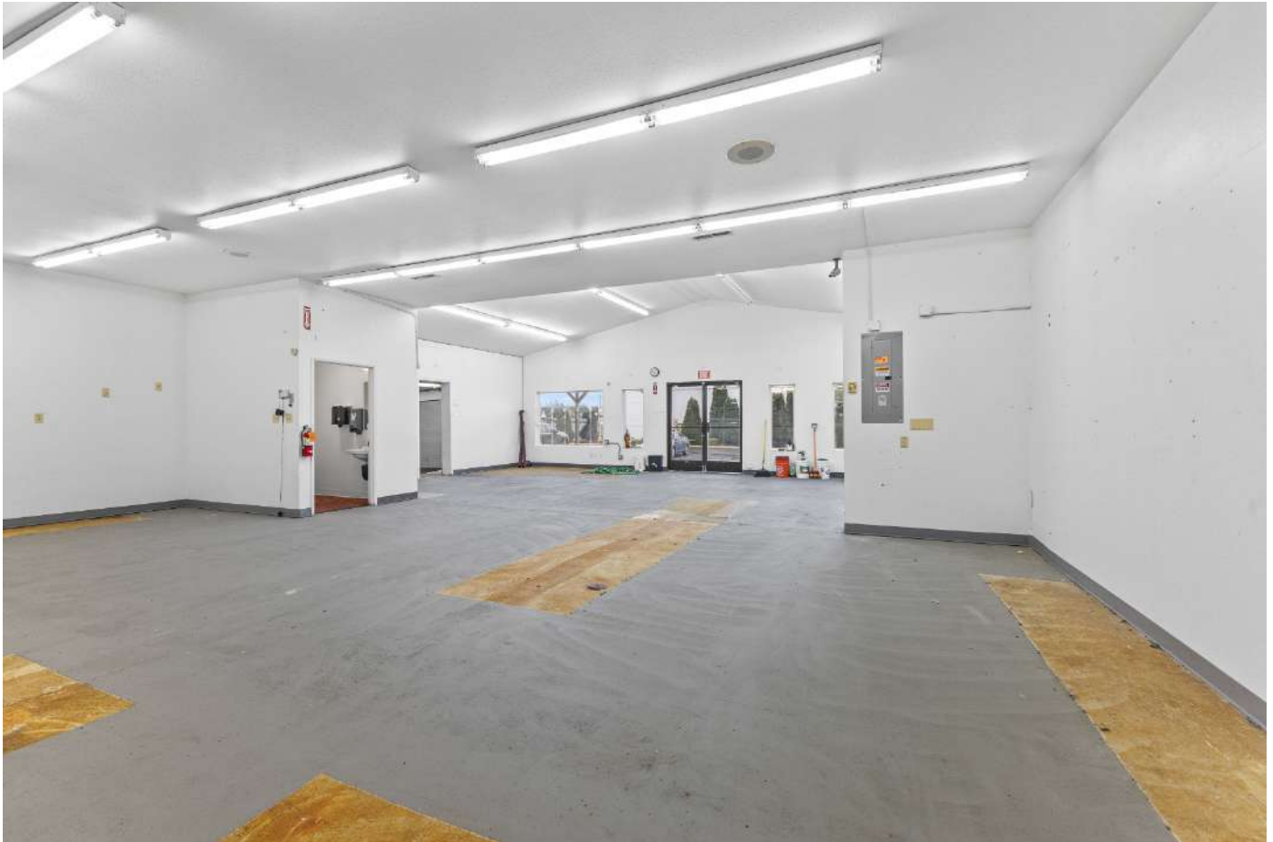
Unit B — Full Depth Wide-Angle: Both Rooms, Front Entry & ADA Restroom Access

Unit B is the largest vacant unit in the complex — a versatile open-floor commercial space spanning ±4,000 SF across two connected rooms with polished concrete and sealed floors, high-bay fluorescent lighting, cedar feature walls, an in-unit ADA-accessible restroom, and both a front entry and rear exit door. The space is well-suited for retail, fitness, medical/professional office, service business, or specialty use. At ±4,000 SF, this unit represents the largest single upside opportunity in the portfolio.