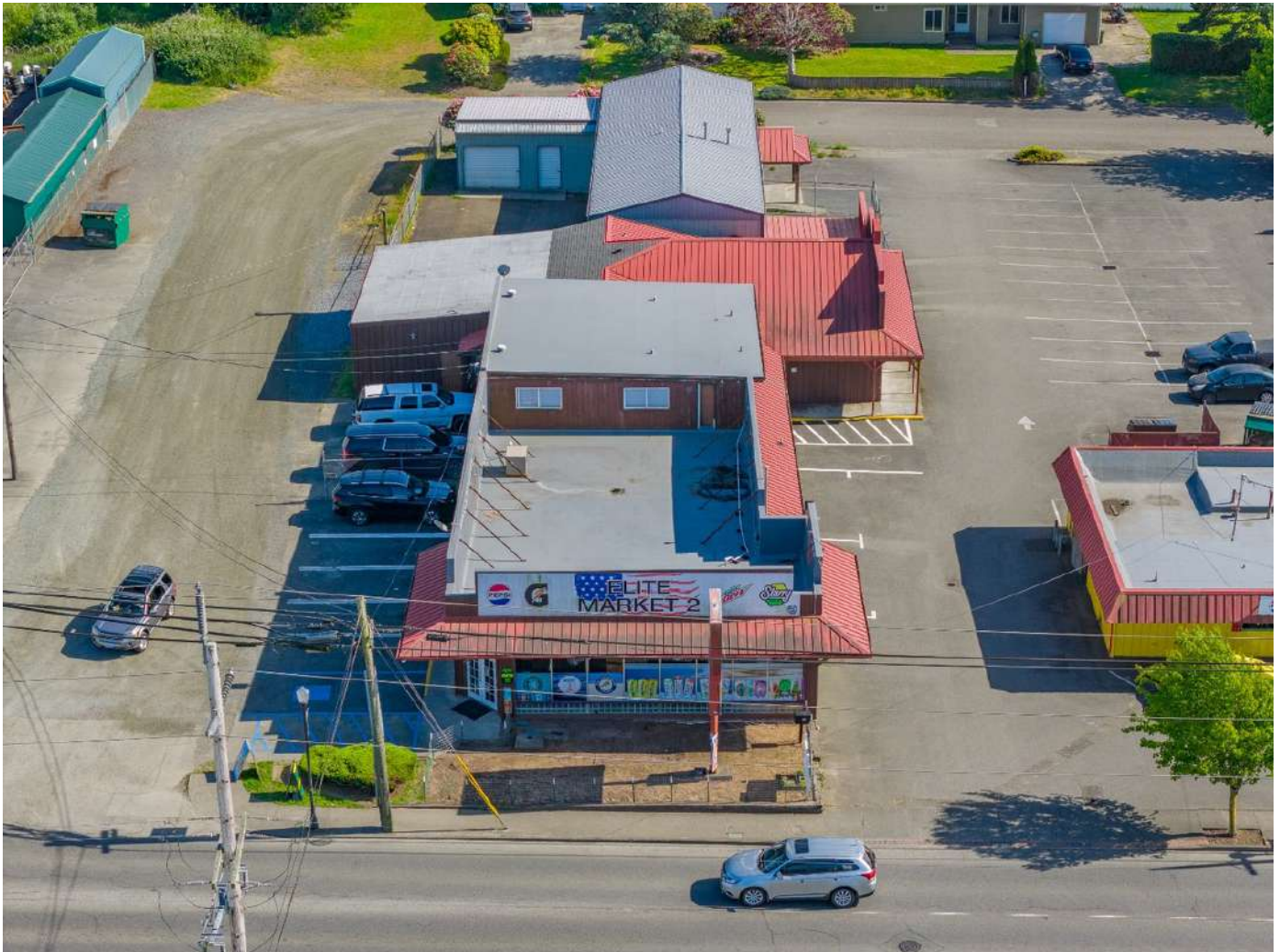
Aerial — Top-Down View Showing Full Building Footprint, Roof & Parking