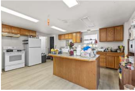
Kitchen — Island & Washer/Dryer Hookup