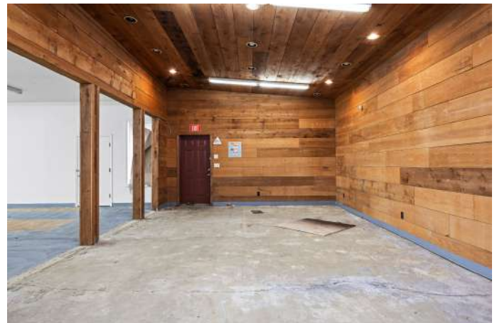
Unit B — Cedar Wall Detail, Recessed Lighting & Rear Exit