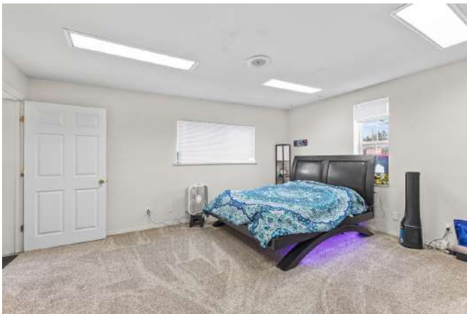
Apartment — Bedroom 1 (Carpeted, Recessed Lighting)