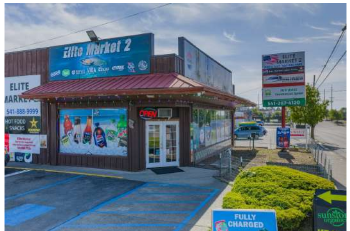
Corner View — Building Entrance & Signage