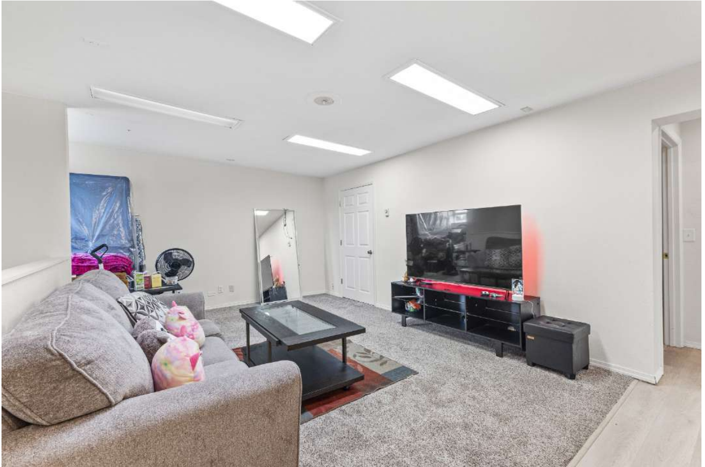
Apartment — Living Room with Recessed Lighting & Carpet

The upper-level residential unit is a 2-bedroom, 1-bathroom apartment currently leased and income-producing. Accessed via a private interior staircase, the unit features two spacious carpeted bedrooms with recessed lighting panels, a full kitchen with island and washer/dryer hookups, and comfortable living space above the retail floor — a turnkey rental asset.