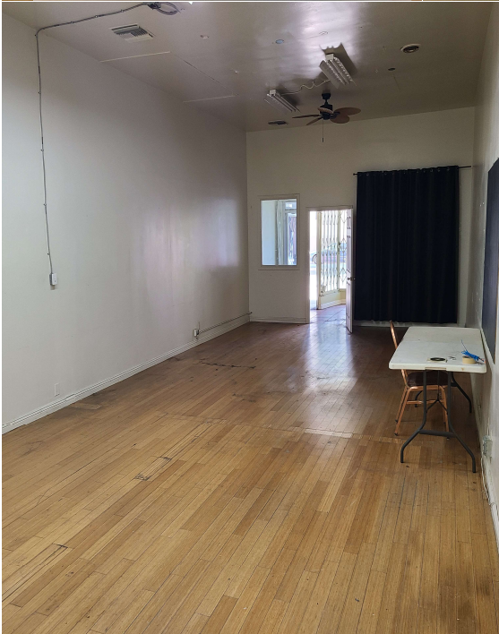
Floor plan top left Frontage with security gates top right Main room with wood floors