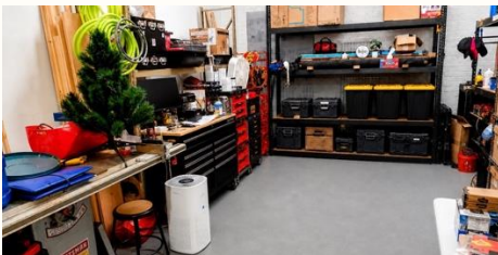
UNIT 4E WORKSPACE