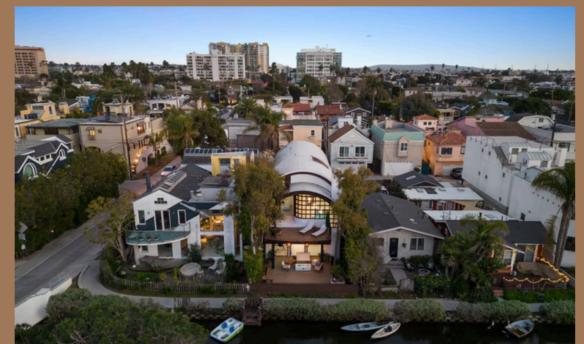
URBAN DENSITY ON THE WATERFRONT