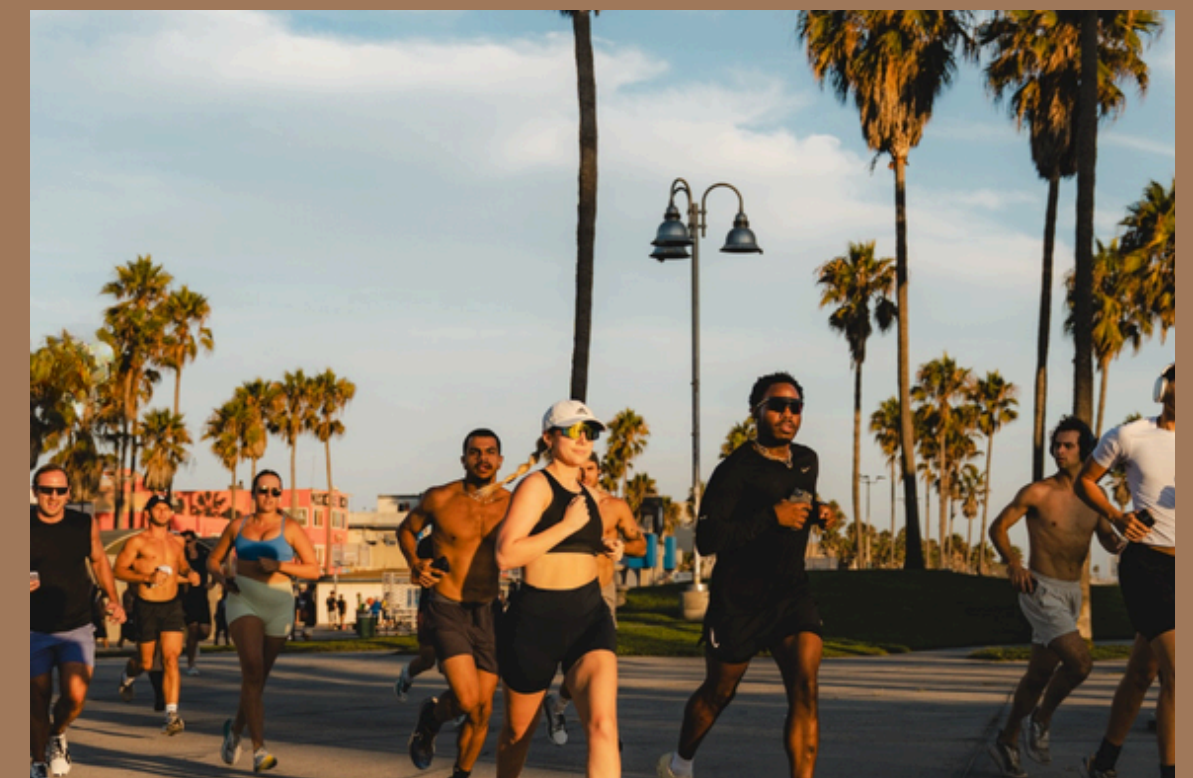
ACTIVE, OUTDOOR LIFESTYLE