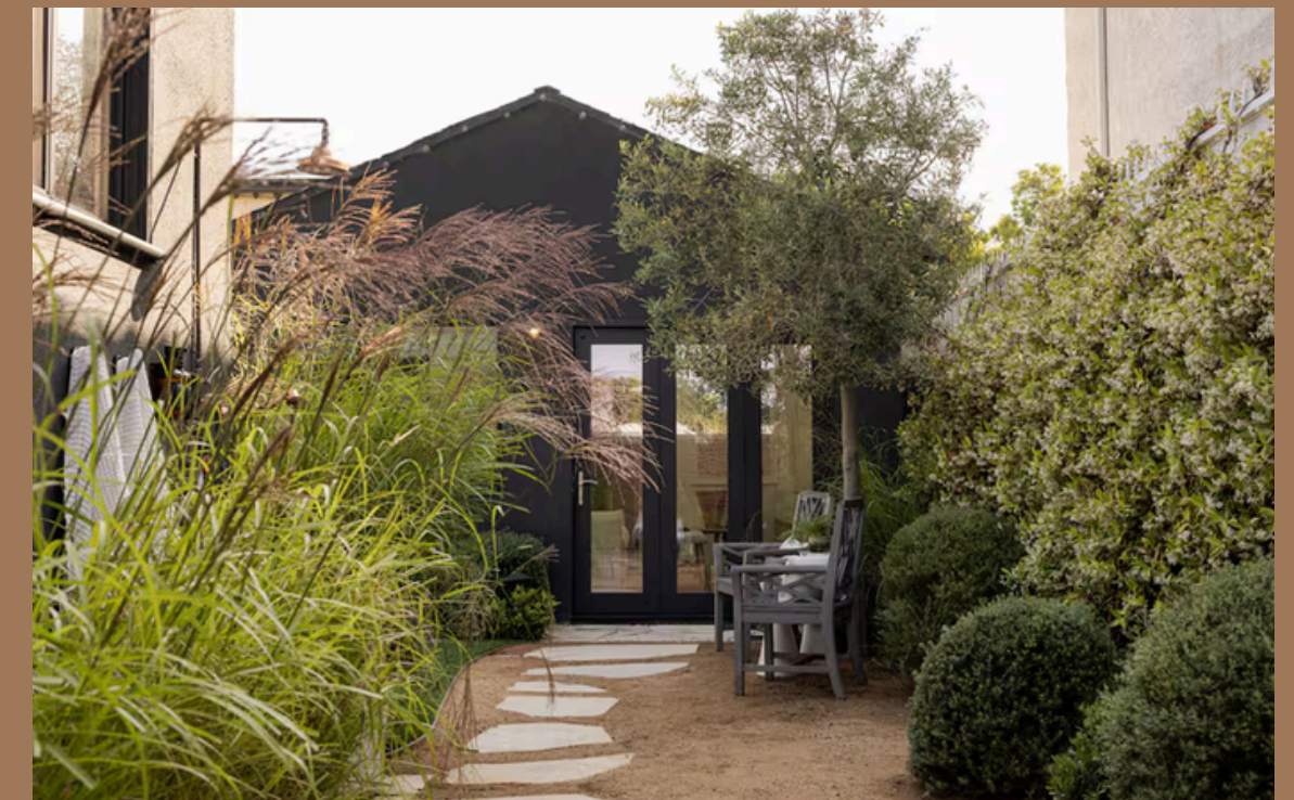
$1.4M AVERAGE HOME PRICE

Marina del Rey combines a vibrant coastal lifestyle with an affluent, experience-driven audience, making it an ideal location for luxury dining. The harbor attracts residents and visitors who value waterside views and outdoor leisure – boating, shopping, cycling and beyond. Walkable streets and marina promenades encourage foot traffic and casual stops, creating opportunities for both destination dining and spontaneous visits.