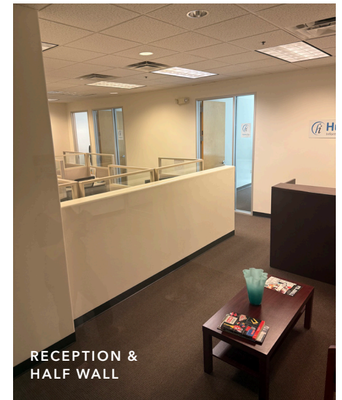
RECEPTION & HALF WALL