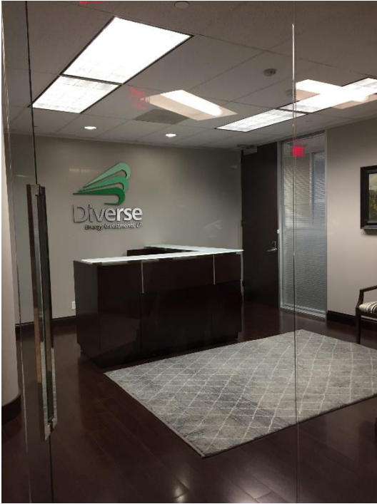
Reception off Lobby