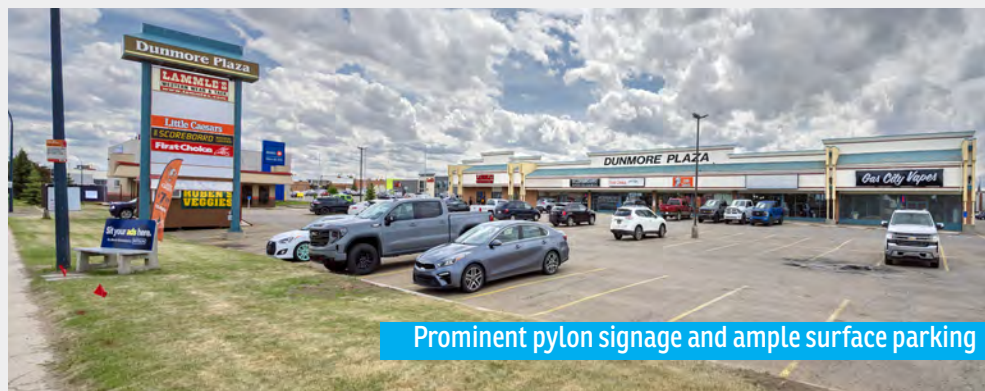
Prominent pylon signage and ample surface parking