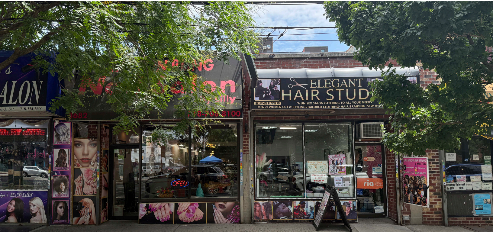
STREET VIEW — 3682 WHITE PLAINS ROAD, BRONX, NY 10467