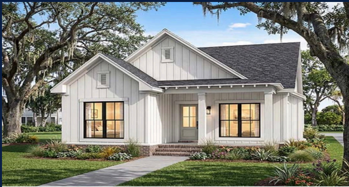
Active Adult Cottage Homes (72 Units)