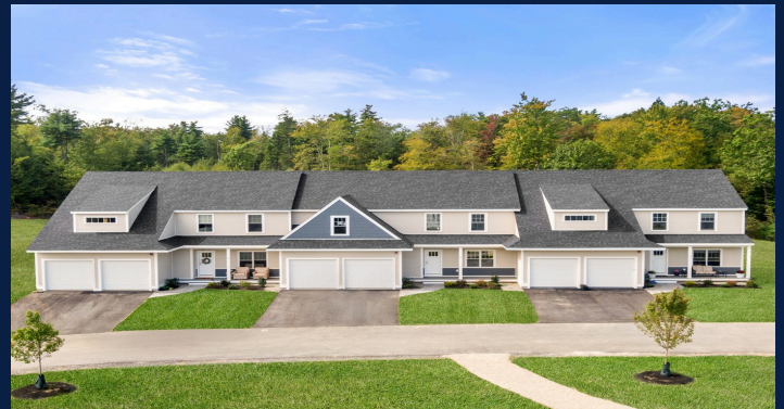
Townhome / Workforce Housing (35 Units)