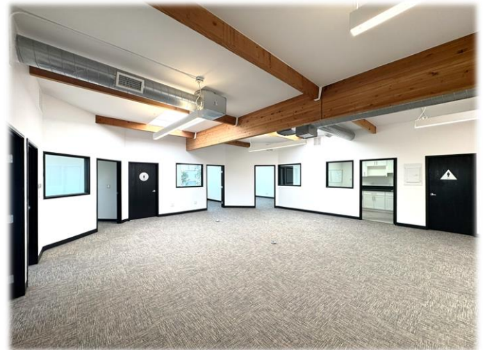
Creative Offices with Cubicle Bull-pen