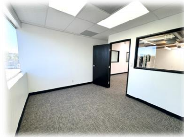
6 Creative Offices