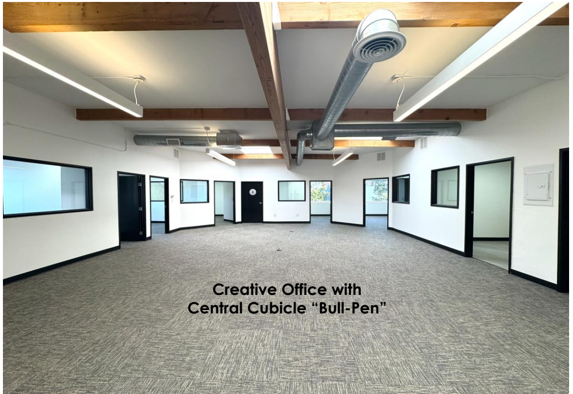
Creative Office with Central Cubicle "Bull-Pen"