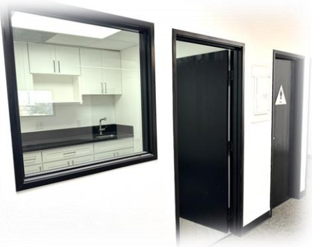
Kitchenette and Private Restrooms

Well Appointed and Professional Landscaping